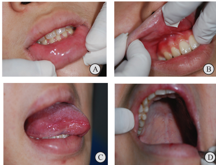
Figure 2. Ulcerated oral mucosa healed after treatment with two weeks of 500mg Valacyclovir (A-D).