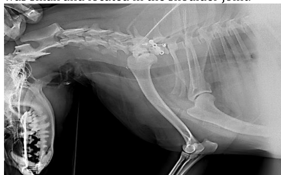
Picture 2. Post-operative after tuberglenoid fixation

Bone grafting was conducted using combination of locking plate and wire. The plate was attached to the columnar os scapula and tuberglenoid, then to reinforce and make it flexible we added wire mounting across the plate (picture 2). After breaking a bone grafting done, the muscle was stitched by using polyglactin suture as well as in the subcutaneous section. Then for the skin was stitched by using silk suture. This surgery took approximately four and half an hour. This bone grafting was very difficult because the broken bone was small and located in the shoulder joint.