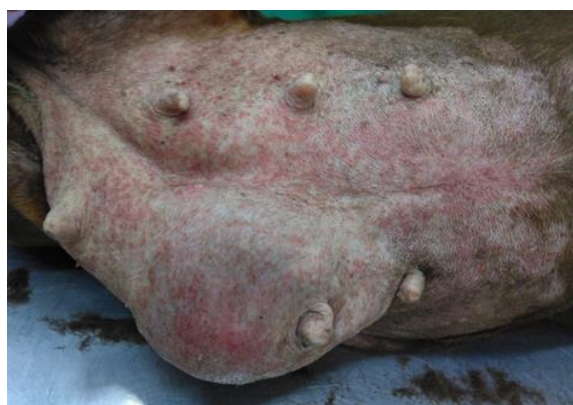
Figure 1. Gross findings during the physical examination. The patient exhibited had mammary mass in the left caudal mammary gland (13.5 cm × 7.6 cm in size).

An 8y old female Dachshund Miniature Dog named Casey came to Teaching Animal Hospital University of Brawijaya, May 2018, with a large ventrocaudal adominal mammary mass. She was anorexic, and depressed, no vaccination history, never mated, last wormed April 2018. Results of the physical examination were, weight 11.5 kg, temperature 39,7 C, HR 120/minute, RR 48/minute, CRT <2 sec. There were visible lumps on the left mammary glands of the three nipples from caudal and petechia around the abdomen (Fig. 1). Palpation of affected mammary glands found several hard nodules within the glands. These areas were further investigated by performing FNA's, and cytology. Also CBC, and blood chemistry were performed.