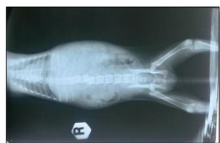
Figure 2. Dorso ventral Recumbency Radiograph

Prognosis. Prognosis of the surgery is fausta but neurologic damage on both extremitas pelvina might be permanent.