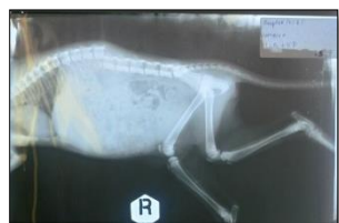
Figure 1. Lateral Recumbency Radiograph

Diagnose. Radiographically showed fracture between os lumbalis II and III.