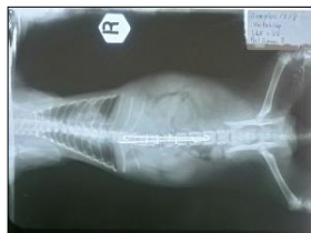
Figure 6. Dorso ventral recumbency radiograph