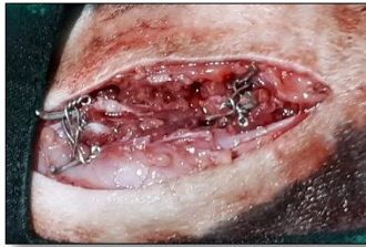
Figure 4. Placed position of pin and wire

Pass lengths of the orthopedic wire through the hole and lay them flat. Choose to intramedullary (IM) pins at appropriate thickness for the patient. Using the hand-held or wire twister band the ends of the IM pins so that they can be placed around the cranial and caudal dorsal processes spinous at limit of the fixation. Placed these IM pins on top of the previously place orthopedic wire to lay against the dorsal lamina. Tighten the orthopedic wires around the IM pins using a wire twister.