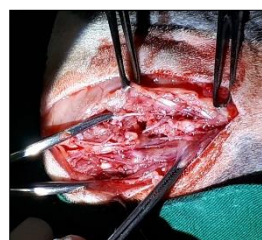
Figure 3. Exposing the processes spinous

Incised through subcutaneous fat and fascia to reach the thoracolumbal. Incise fascia to expose an underlying second layer of fat and the thoracolumbal musculature. Clear the musculature of the pedicle until the processes spinous exposed.