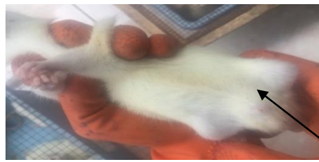
Fig. 2. The location of vaccine injections subcutaneously, there was no change in rat skin tissue

Observations of the three groups of rats immunized showed that all rats looked healthy, appetite did not change with normal behavior until 4 weeks after vaccination. Rat body weight experienced a normal increase. In group II which was immunized with anti-idiotype antibodies with the addition of chitosan nanoparticle adjuvants, there were no changes in rat skin tissue at the site of vaccine injection (Fig.2).