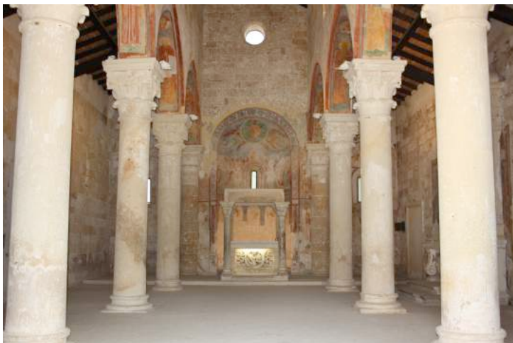
Figure 5: Lecce. Abbey of Santa Maria di Cerrate