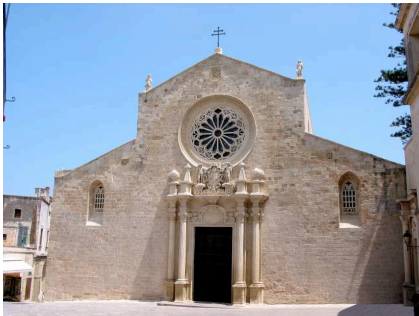
Figure 8: Otranto (Lecce). Cathedral.