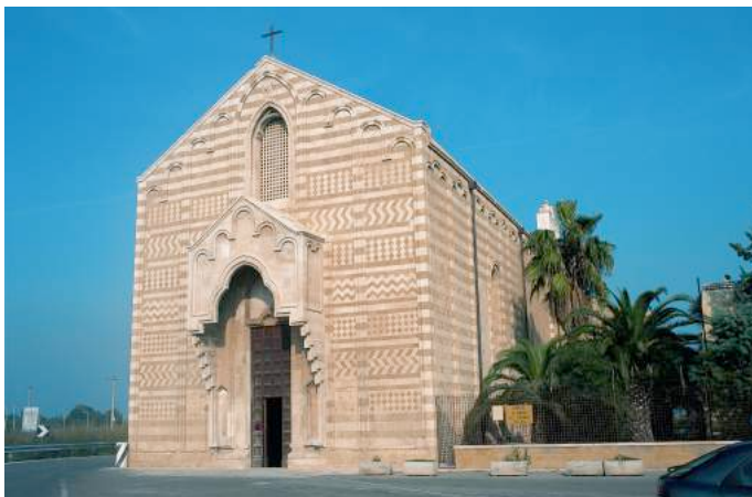
Figure 3: Brindisi. Santa Maria del Casale