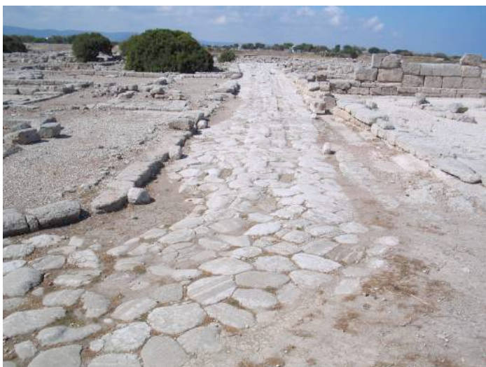
Figure 1: Fasano (Brindisi). Roman cart-tracks along the Via Traiana in Egnazia