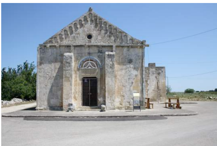
Figure 6: Surbo (Lecce). Church of Santa Maria d'Aurio

After leaving Lecce and the close-by fortified hamlet of Acaya, with its famous castle from the 16 th century, we reach the so called Grecìa salentina , one of the most interesting areas in Salento in terms of cultural heritage and tourism highlights. Rich in natural and cultural resources (with special reference to languages, music, archaeology, architecture and arts), the territory can be exemplified by three main elements: water, olive oil and stone, standing out as symbols of the local “ salentinità ”. These elements are raised to eternity by the pietra (stone) used to build the houses with the typical inner courtyard, shelters and megalithic buildings - such as the two dolmens Gurgulante and Placa and the menhirs Grassi and Staurotomea . Water scarcity is addressed with an ingenious system (perhaps invented by the Byzantines) called pozzelle : this is because the territory lacks in superficial hydrography, but is rich in subterranean water sources. Olive oil dominates the landscape and production activities, with its story, made up of ups and downs, told by ancient oil mills and modern olive presses scattered across the whole territory. In the heart of Grecìa we