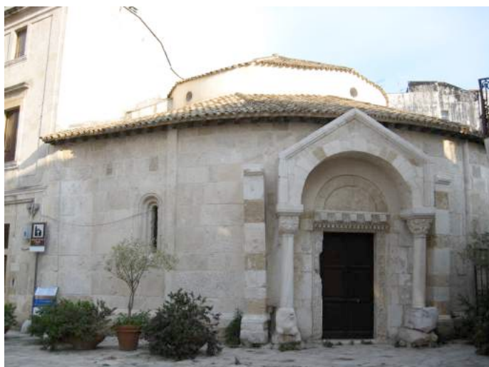
Figure 4: Brindisi. San Giovanni al Sepolcro