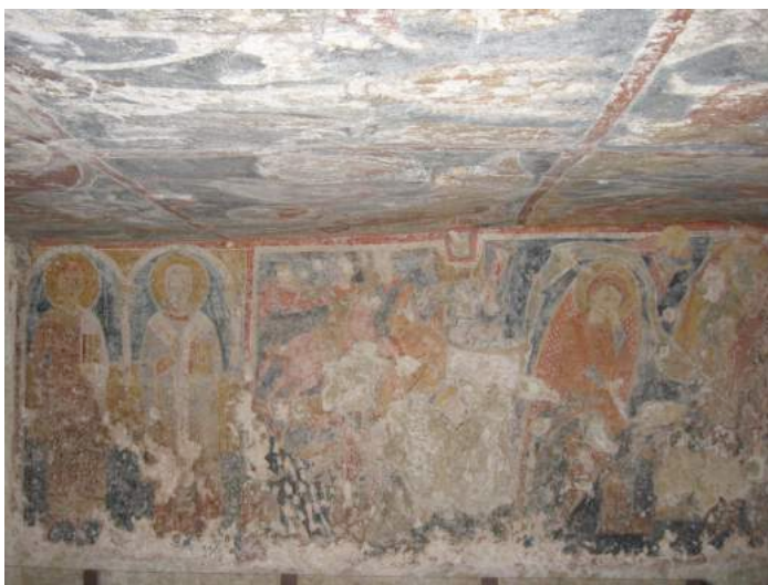
Figure 2: San Vito dei Normanni (Brindisi). Hypogeal crypt in San Biagio

Sant'Anna and the castle Dentice di Frasso in Carovigno. Proceeding towards Brindisi, the Sanctuary of Madonna di Belvedere, an important pilgrimage destination, and the hypogeal crypt of San Biagio, enriched with a beautiful cycle of frescoes (fig. 2), also deserve a visit. The city of Brindisi provides significant evidence of the presence of chivalric orders in the Church of Santa Maria del Casale (fig. 3) , where the Templars of the Reign of Naples stood trial in 1310, as well as in the Temple of San Giovanni al Sepolcro, renown for its peculiar round-shaped layout – an interesting reproduction of the Anastasis of the Holy Sepulchre of Jerusalem, owned by the Jerosolimitan order (fig. 4).