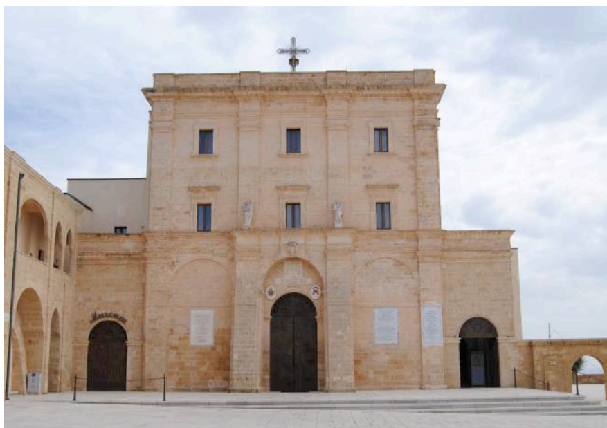
Figure 10: Castrignano del Capo (Lecce), Sanctuary and basilica Santa Maria De Finibus Terrae