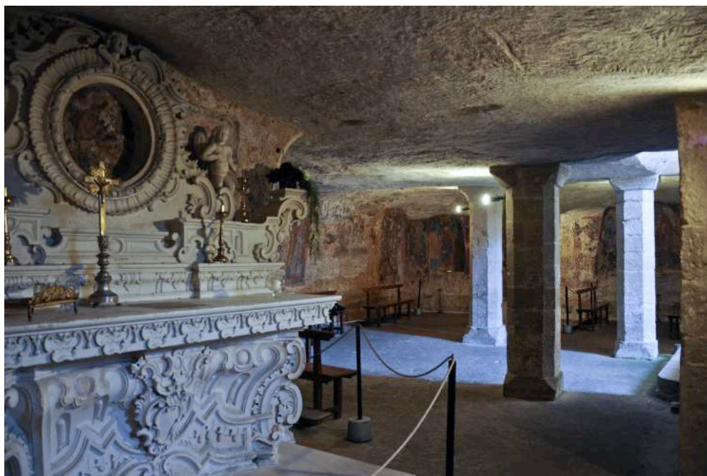
Figure 7: Carpignano Salentino (Lecce). Crypt of Santa Cristina

find remains of the ancient Calimera woods and the small Church of San Vito. After proceeding for nearly 600 hundred metres along cart-roads between Martano and Carpignano Salentino, the visitor can appreciate the medieval farmhouse in Apigliano, today an archaeological park, as well as numerous worship places and pilgrim destinations (e.g. the Monastery of the Cistercians, the Sanctuary of the Madonna della grotta and the crypt of Santa Cristina in Carpignano Salentino (fig. 7).