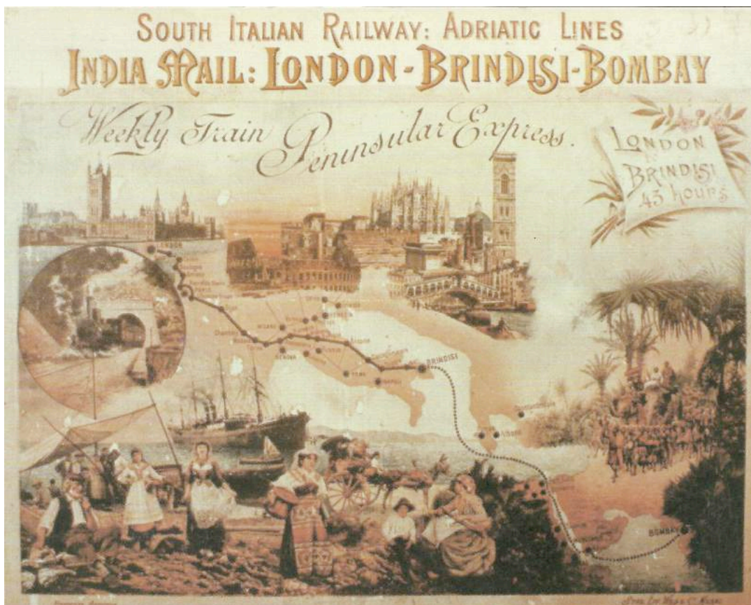
Fig. 9: Original postcard detailing the route of the India Mail