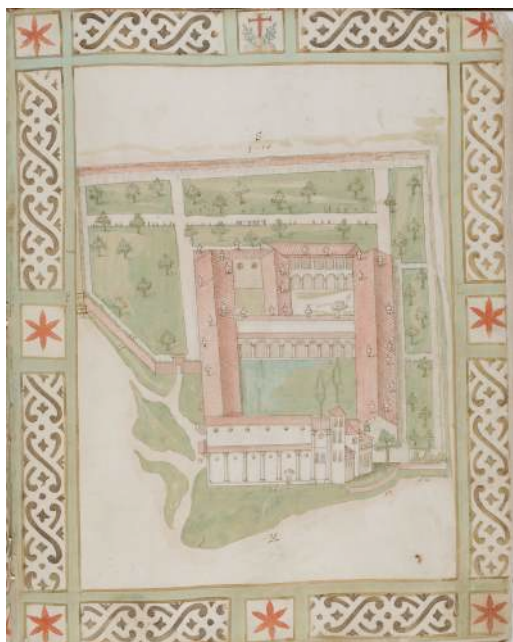
Figure 7: Terrilogo of Monastery of San Ponziano (1564-1573)

Source: A.S.D.Lu. A.A.Lu., Enti Religiosi Soppressi , 2, c. VIr