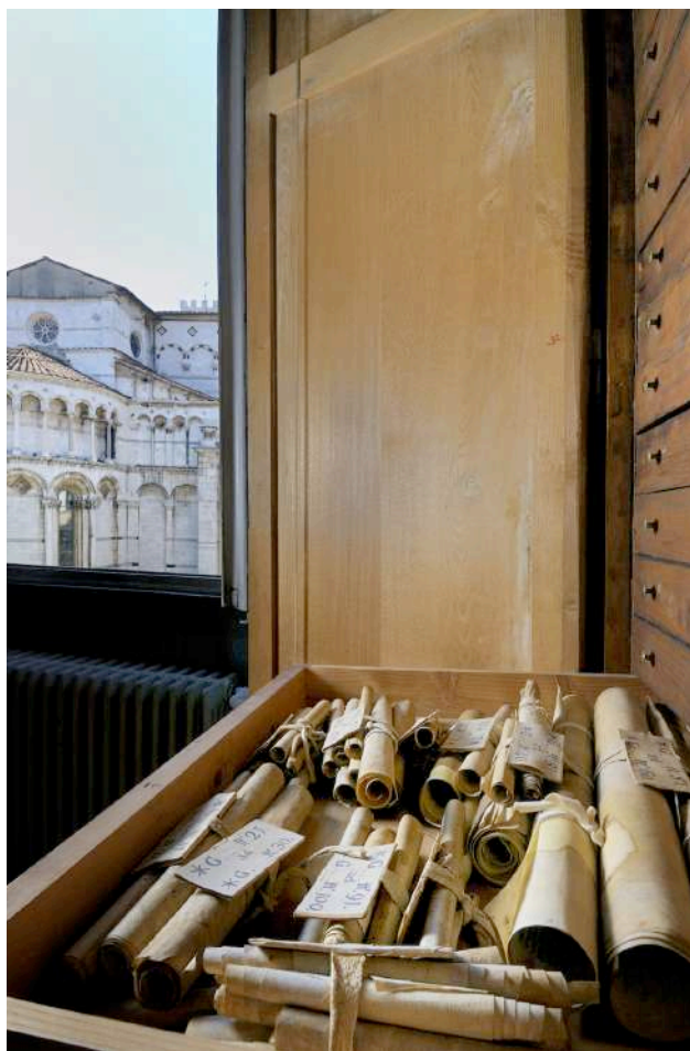
Figure 3: Diplomatic Collection