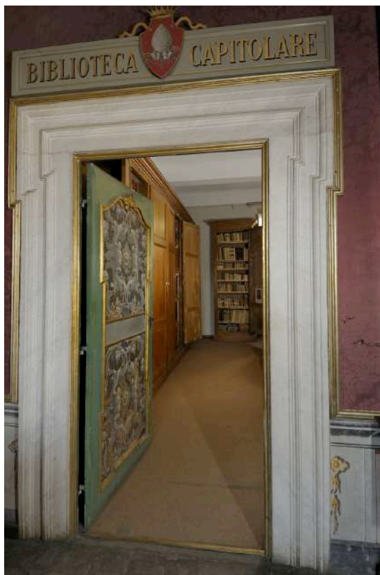
Figure 9: Chapter Library