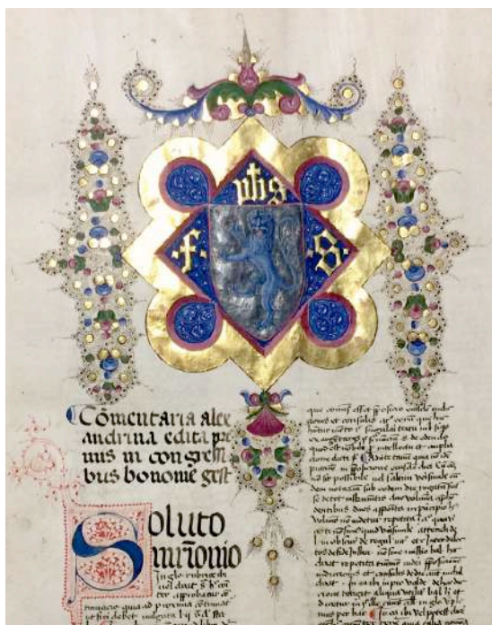
Figure 11: Coat of arms of Felino Sandei