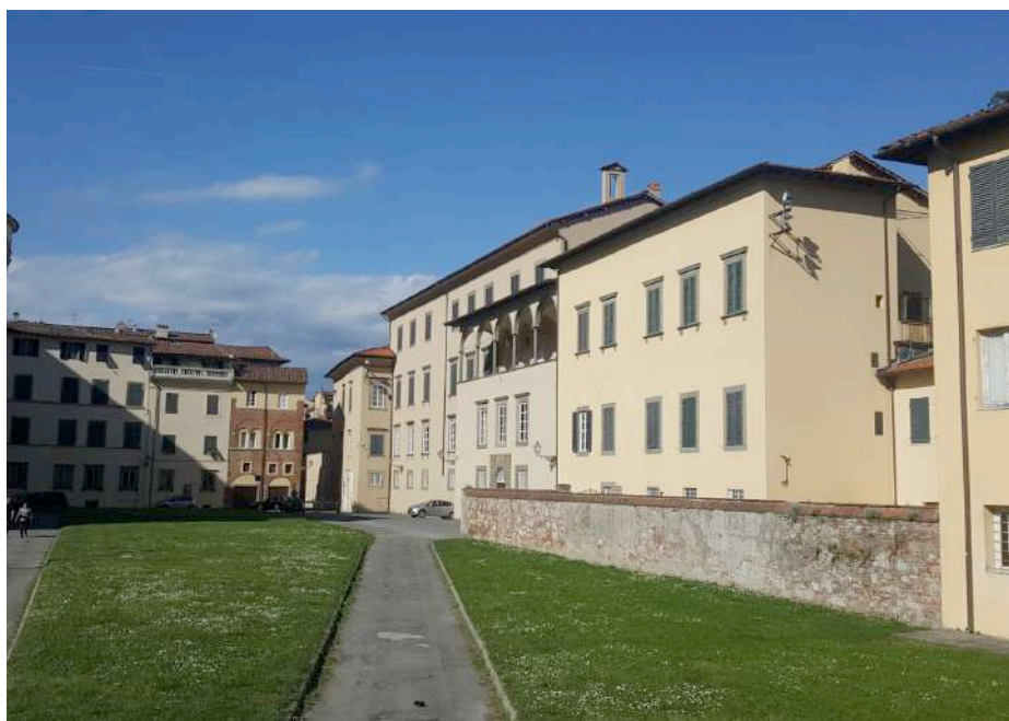
Figure 1: Lucca, Archiepiscopal Palace

Among the archives distinguishing in Italy and in Europe by their importance we have to mention the Vatican Secret Archives, the most significant ecclesiastical archive in the world. Looking at the outline of the history of the Church the second one is the Historical Diocesan Archive of Lucca where, in addition to the incredible documentary heritage there preserved, much more peculiarities must be identified. Considering the Historical Diocesan Archive of Lucca, its geographical location testifies its importance. Located inside the Archbishop's Palace just behind the Lucca Cathedral, the Archive is present in all levels of the building. The original wardrobes belonged to the Archives of the Beneficiati of the Lucca Cathedral (i.e., an ancient city institution dating back to the 11 th century; Savigni, 2010) are placed along the corridors and in the halls of the various floors. There are also the original wardrobes coming from the parsonage of the Church of Saints Paolino e Donato, inside which the volumes and records of the same parish are stored. Moreover, wardrobes of the Ruspoli donation host the archives of the Deanery and the Seminary of San Michele in Foro, along with the archives of various brotherhoods (i.e., Suffrage, Holy Trinity, and Saint Mary of the Rose). (Figures 1-2)