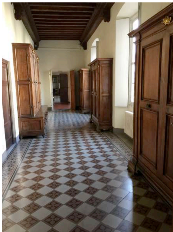
Figure 2: Lucca, Archiepiscopal Palace: 1st floor