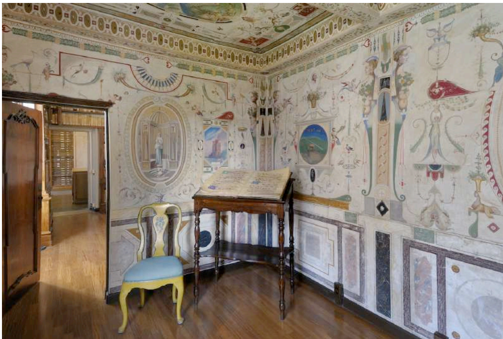
Figure 14: Archbishop's Study