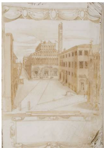
Figure 6: Terrilogio of Chapter of Lucca Cathedral