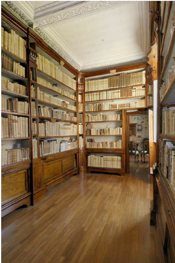
Figure 13: Archiepiscopal Library