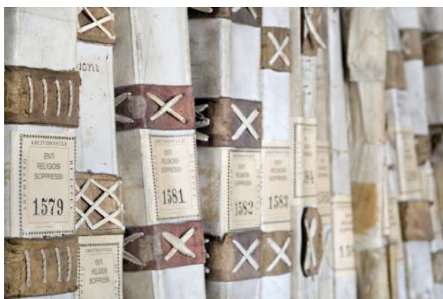
Figure 5: Registers of contracts, lenders, book of financial statements

of each property. The importance of this documentary typology is also evidenced by the presence of numerous treatises on the correct compilation of these registers, including the volume on the cadastre by Francesco Antonio Filonzi, in which there is a part dedicated to best practices for the realization of a cabreo (Filonzi, 1775). Lucca played a major role in the realization of these volumes. The iconography of Tuscan patrimonial books, with axonometric or bird's-eye plan representation of real estate properties, is attributable to the experience of Lucca in compiling its own martilogi and terrilogi. More than 700 volumes of terrilogi can be found in the repositories of the Historical Diocesan Archive, most of which are watercolored and decorated, with the reconstruction of numerous in scale buildings (Rossi, 2015b). Between 2013 and 2014, during the 500th anniversary of the construction of the Renaissance walls of Lucca, the Historical Diocesan Archive organized an exhibition at the State Library in order to reconstruct the iconography of the city through the terrilogi of churches and monasteries located inside the walls between the 15 th and the 18 th century (Cappellini, Rossi, & Unfer Verre, 2015). (Figure 7)