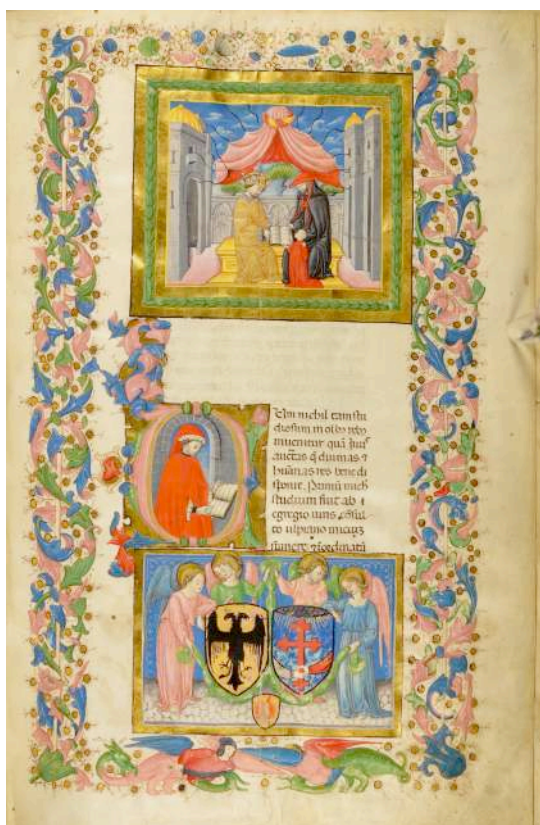
Figure 12: ANTONIUS MINUCCIUS DE PRATO VETERI, De Feudis