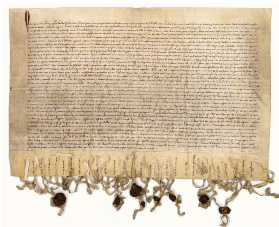
Figure 8: Diploma for Earl of Hergies