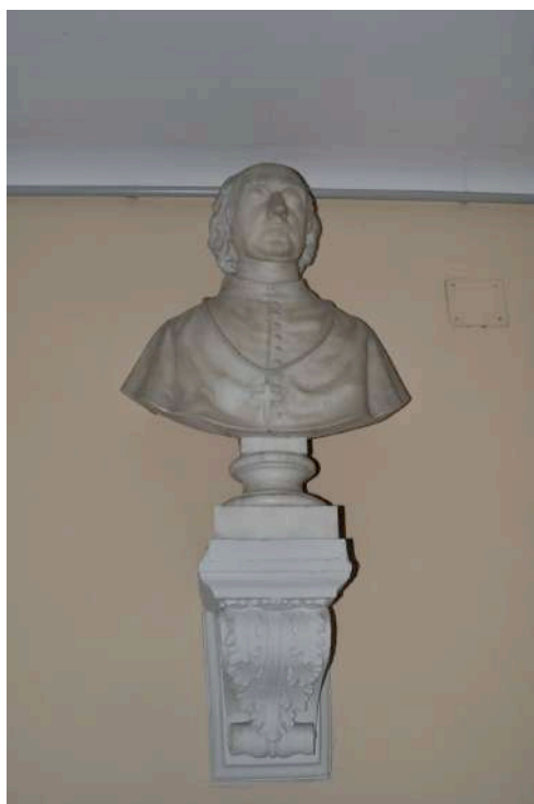
Figure 2: Cardinal Oppizzoni's bust

We owe to Cardinal Oppizzoni (1802-1855) ( Figure 2 ) the reorganization of the diocese after the Napoleonic confiscations, and on this occasion, the archive was almost entirely refounded, starting from its seat.