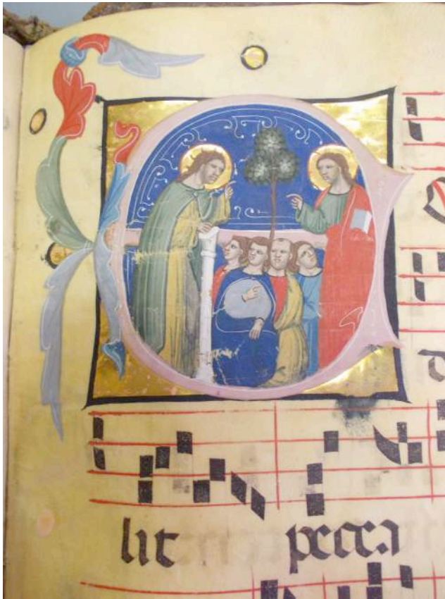
Figure 10: Miniated initial letter “E” (Ecce Agnus Dei)