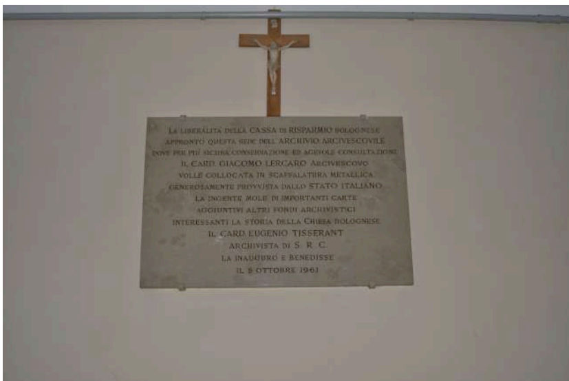
Figure 9: New opening's memorial plaque

The transfer of the funds, in Summer 1961, was the prelude to the inauguration (October 5th) of the today's seat of the Archivio Arcivescovile and to the new opening to the public starting from the month of February of the following year ( Figure 9 ).