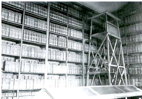
Figure 3: Hall in the second seat of the archive with wooden shelves

Between 1818 and 1826 the halls on the upper floor in the southern wing of the archiepiscopal palace, which previously had been the seat of the College of the Doctors (where the students of the University of Bologna graduated: Alma Mater is known as the world's most ancient University), were readapted as archival deposits. High wooden shelves were leant against the walls; they were six meters high and one meter deep, and they were filled with a great deal of documents ( Figure 3 ).