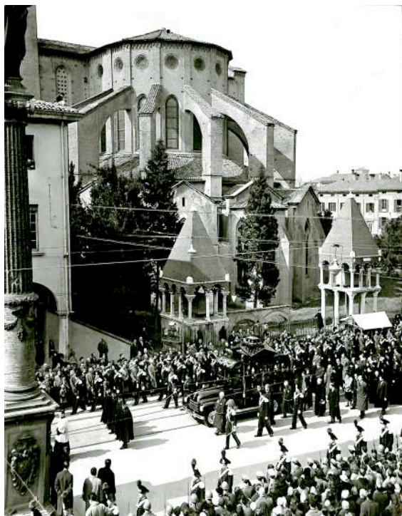
Figure 4: Procession of St. Luke's Madonna (first half of XX century)

through the archiepiscopal printing works, and also other civil and clerical prints). Also other archives were included: the Fabbrica of S. Pietro , concerning every document about the rebuilding of the Cathedral in Bologna (XVI century) and the following restoration works; some fragments from the Holy Office court in the XVII and XVIII century; the Azienda rogazioni minori concerning the traditional descent of the image of St. Luke's Madonna into the town: this tradition has been repeated every year for almost six centuries ( Figure 4 ).