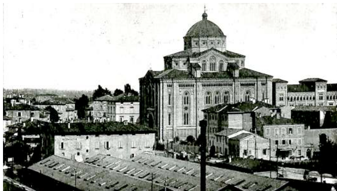
Figure 6: Sacred Heart of Christ church seen from the near the railway station (1912)

1896); and the organization of several initiatives, among which the most important are the Opera dei Congressi Cattolici (from 1874 to 1879), the Priestly Jubilee by Pope Leone XIII in 1884 and the Solemn Homage to Christ the Redeemer in 1900. In Bologna Giovanni Acquaderni developed his activity in many different ways; here we remember his zeal for the building of the church devoted to the Sacred Heart of Christ: we can still see this church near the railway station ( Figure 6 ).