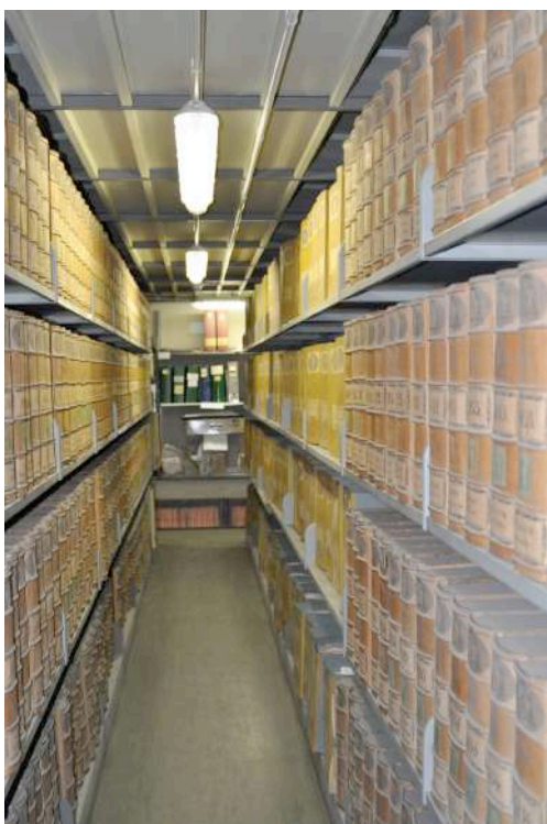
Figure 8: Corridor from the tower deposit in the third seat

The transfer of the funds, in Summer 1961, was the prelude to the inauguration (October 5th) of the today's seat of the Archivio Arcivescovile and to the new opening to the public starting from the month of February of the following year ( Figure 9 ).