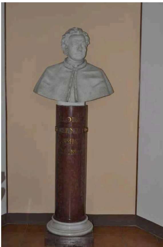
Figure 7: Canon Luigi Breventani's bust