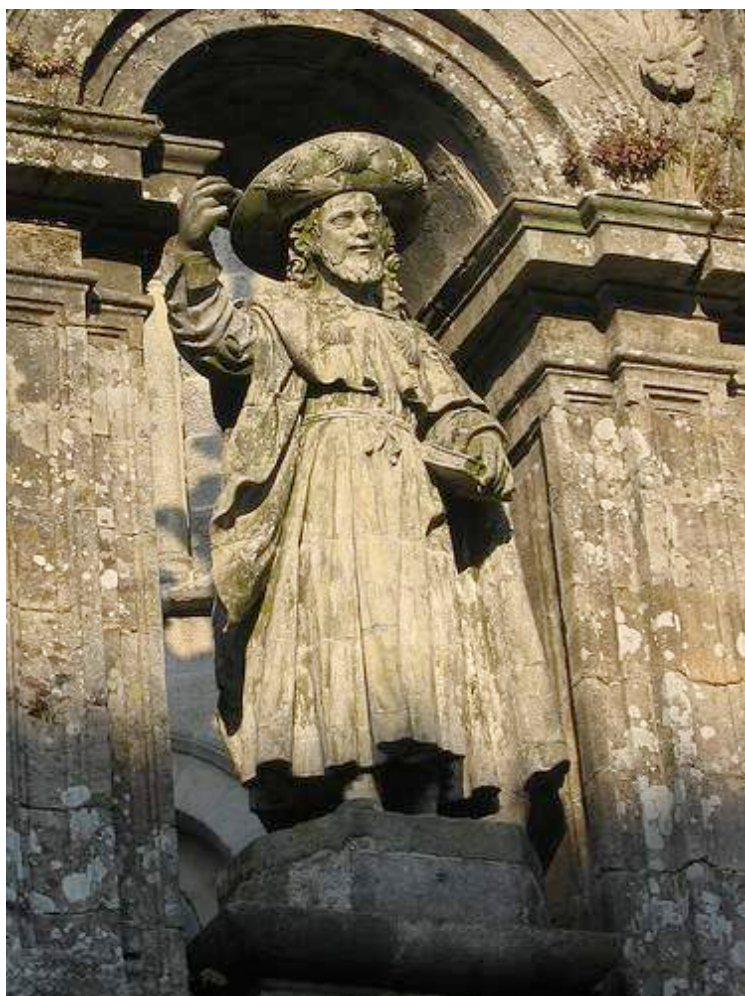
Figure 1: Statue of San Giacomo Pellegrino, Santiago de Compostela Cathedral

The Galician saint was represented mainly in three ways: as an Apostle, as a pilgrim and as Miles Christi . The latter image, known as Santiago Matamoros (literally “killer of Moors”), found its highest expression particularly in Spain, while the others were common in all countries (Bango Torviso, 1993). The image of Saint James as a pilgrim was surely among the most known and portrayed, since his attributes referring to the pilgrims and pilgrimages were iconic; on the other hand, the symbol that most strongly permeated the veneration of Saint James was the popular concha or shell, quintessential signum Peregrinationis of the Camino de Santiago (Caucci Von Saucken J., 2010) (fig. n.1).