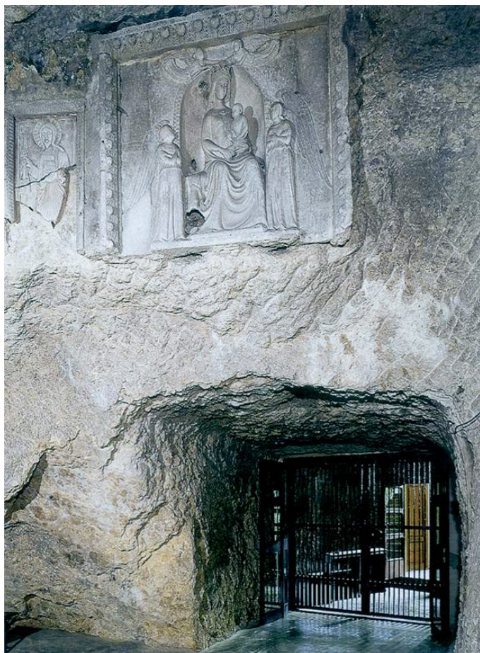
Figure 14: Madonna Incoronata dagli angeli e San Giacomo Apostolo Cava delle Pietre - Grotta di S. Michele, XIII-XV sec. Monte Sant'Angelo, Foggia