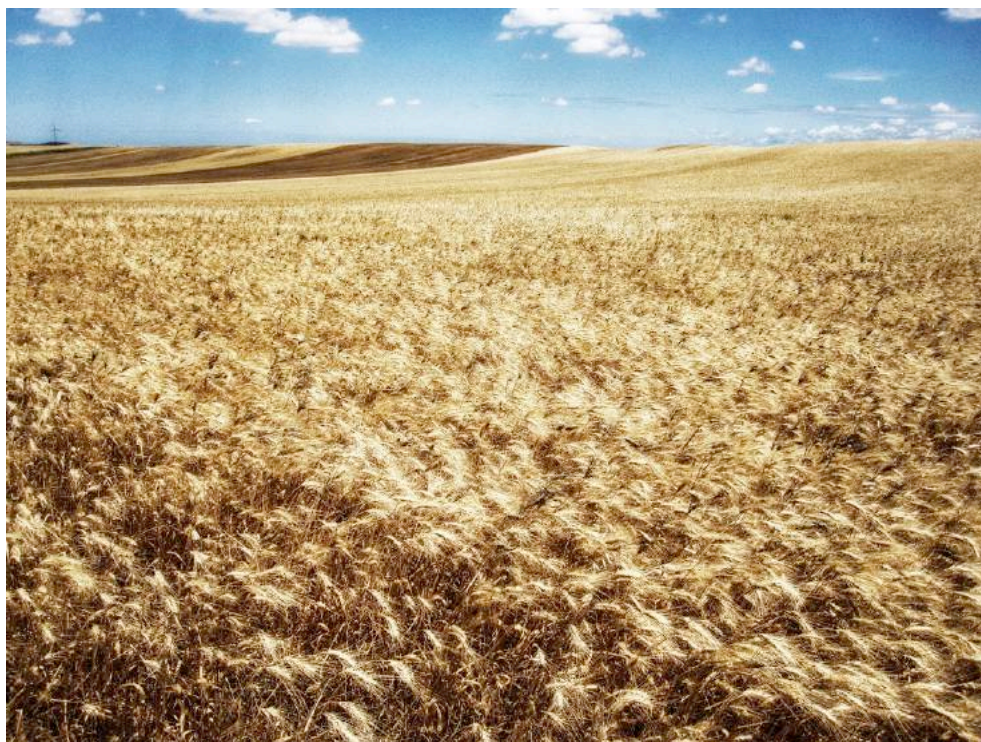
Figure 11: Tratturo Castel di Sangro – Lucera, Tavoliere delle Puglie landscape, Lucera (FG)