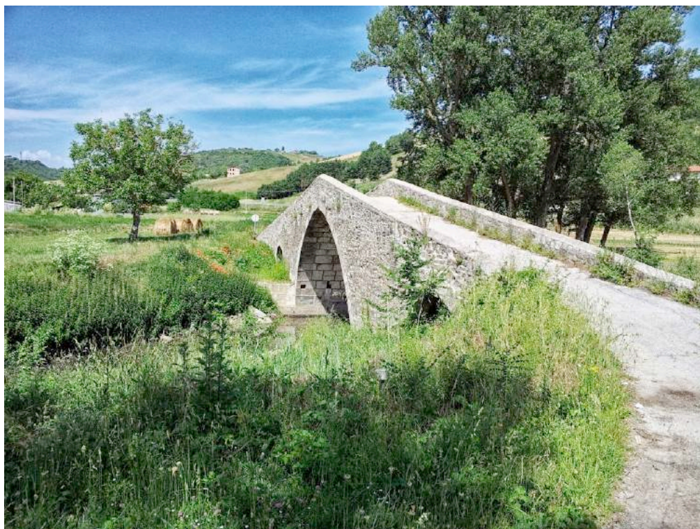
Figure 9: Tratturo Castel di Sangro – Lucera, “Toro Bridge”, Toro (CB)