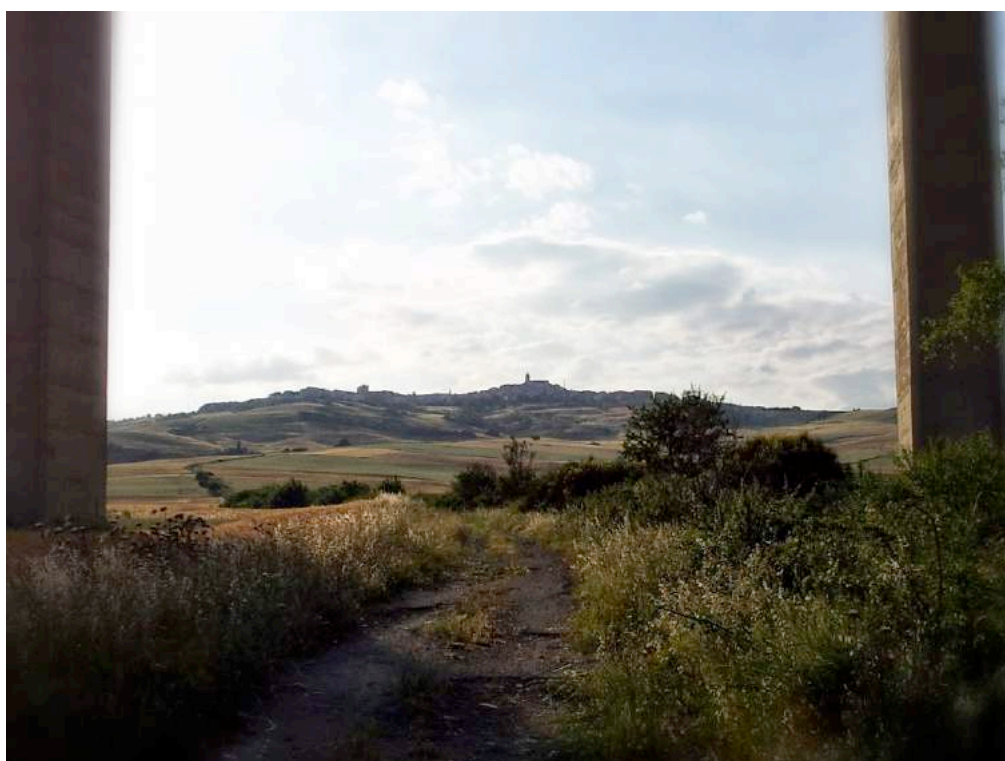
Figure 10: Tratturo Castel di Sangro – Lucera, Motta Montecorvino landscape (FG)