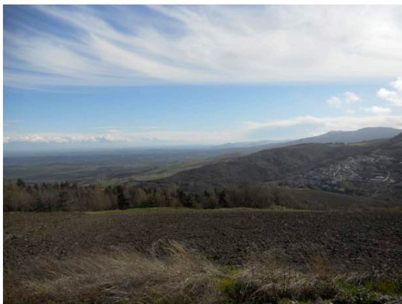
Figure 12: Alberona and Monti Dauni landscape, Foggia

The village of Alberona was a really important stop-over for the pilgrims on the tratturo of Castel di Sangro – Lucera (Stopani, 2005) (fig. n. 12).