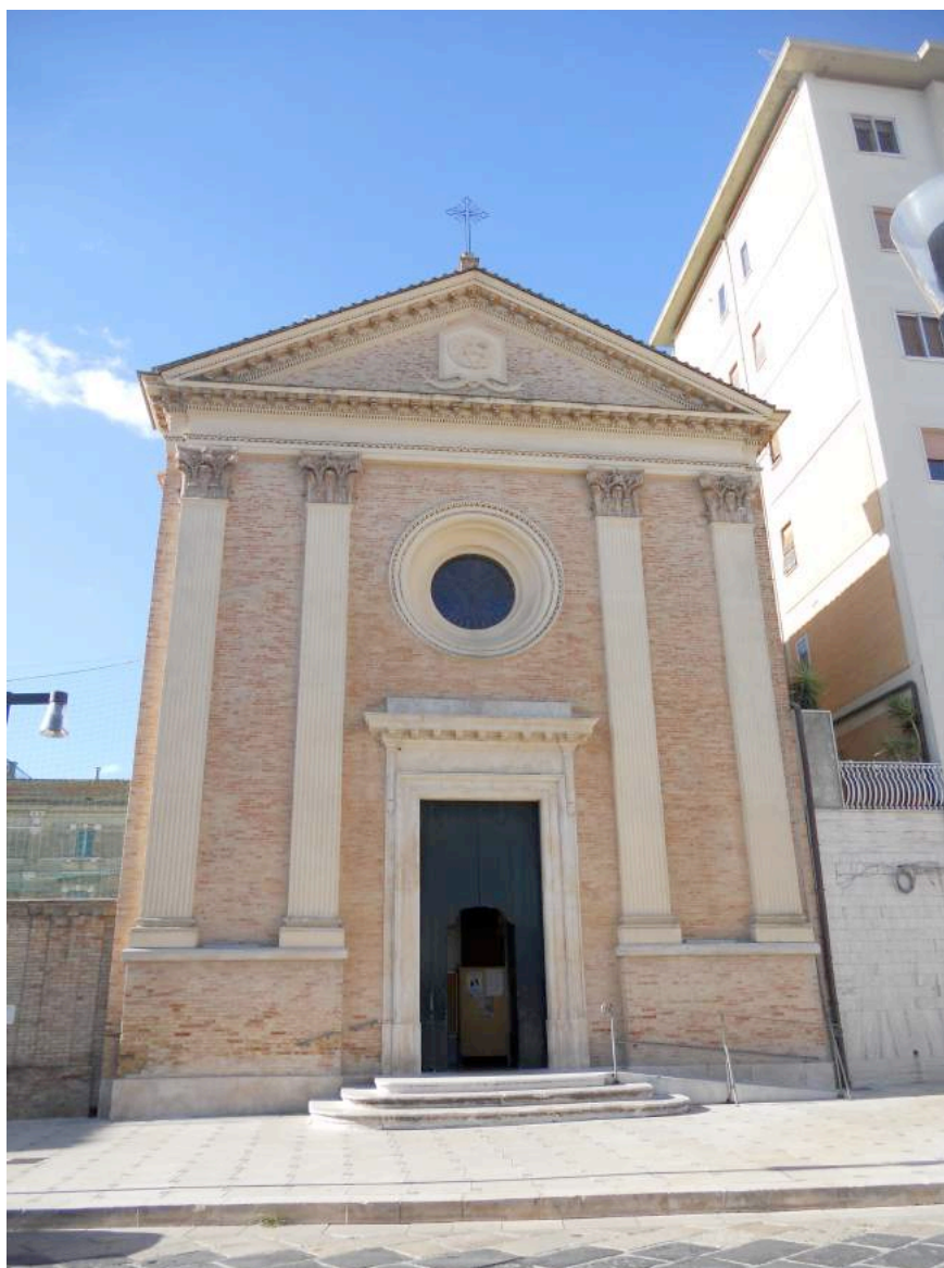
Figure 6: San Giacomo Church, Lucera (FG)