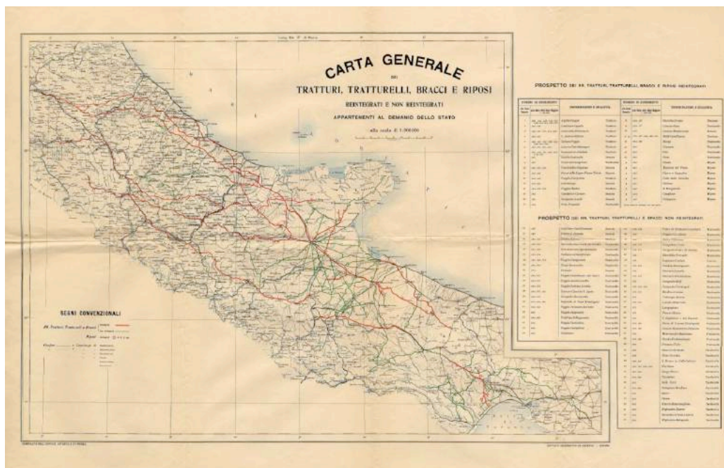
Figure 7: Edited by the Commissariato per la reintegra dei tratturi of Foggia in 1959

The road system consisting in tratturi , tratturelli and smaller roads was very extensive and it roughly coincided with Abruzzo, Molise, Campania, Puglia and Lucania territories. Even if there were many tratturi (Paone, 1987) (fig. n.7), it is possible to identify four tracks for importance and length which went from Abruzzo to Puglia: l'Aquila – Foggia, Pescasseroli – Candela, Celano – Foggia and Castel di Sangro – Lucera (Totani, 2008). The latter was 127.4 km long and was functional to the tracks of Celano – Foggia and Pescasseroli – Candela because it allowed a deeper inroad into the inner territories of Molise to better exploit their pastures. These were called regi (royal) because were under the royal jurisdiction which periodically controlled their boundaries, in order to prevent landowners to take advantage of them.