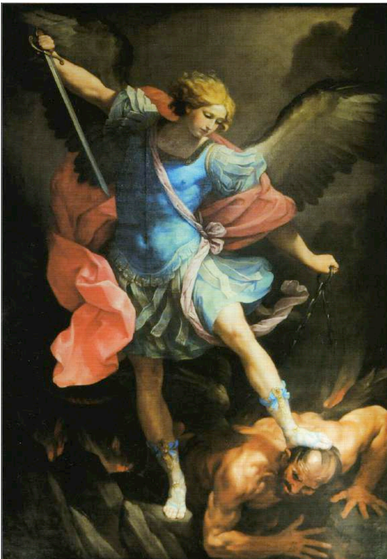
Figure 2: San Michele Arcangelo, Guido Reni, olio su tela, 1635, Museo dei Cappuccini, Rome

In addition to the pilgrimage to Santiago de Compostela, the other holy path that marked the history of itineraries was the one dedicated to the prince of heavenly armies, San Michele (Saint Michael) sul Monte Gargano in Puglia. The cult of the Angel is deeply rooted in the Greek-Byzantine tradition and the first information relating to its appearance in the Western countries dates back to the 5 th century (Otranto – Carletti, 1995). The Miles Dei was venerated especially for his thaumaturgical power but besides this medical function, he had other characteristics such as the role of psychagogue (Ragonese, 2011), psychopomp , weigher of souls, celebrant and God's warrior against the Devil (fig. n.2).