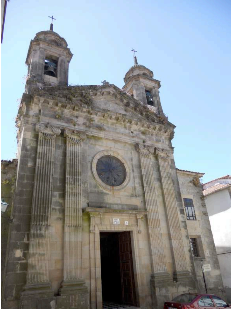
Figure 5: San Miguel dos Agros Church, Santiago de Compostela

the stands of the apse and faced the West, towards the Western gate (Caucci Von Saucken, 2010).