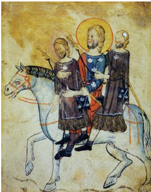
Figure 3: Miracolo della Solidarietà tra pellegrini or di San Giacomo e dei due pellegrini Miniature from the book Società di San Giacomo del Ponte, Palatina Library, Parma