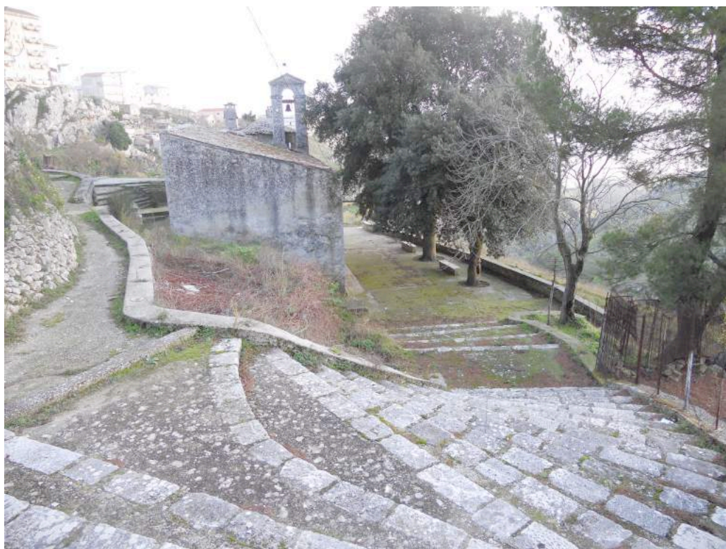
Figure 13: Incoronata Church, XII Century.

There are traces of the cult of the Apostle also in the town in Gargano, such as the small church dedicated to the crowned Virgin Mary located in Valle Portella (Infante, 2003; Otranto 2007) (fig. n.13): it shields a statue of the Apostle of recent manufacture and some scholars suppose that this hermitage was formerly entitled to the Galician saint. Currently there are more researches to better comprehend the origin of the structure (Cavallini, 2004).