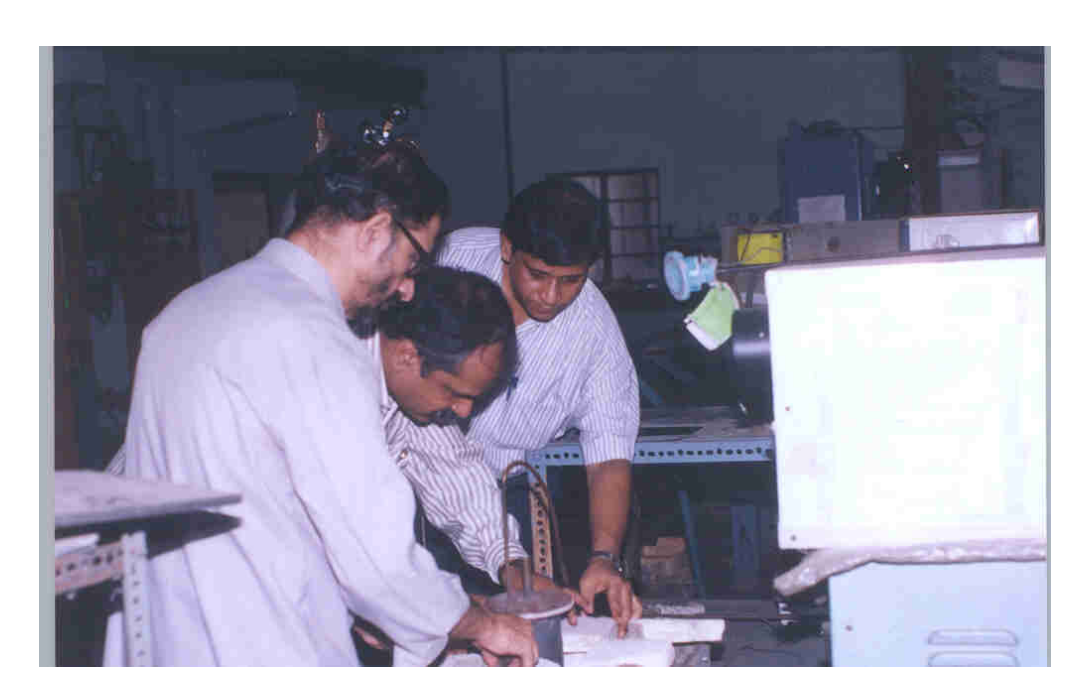
Fig.4 Pot furnace experiment under progress