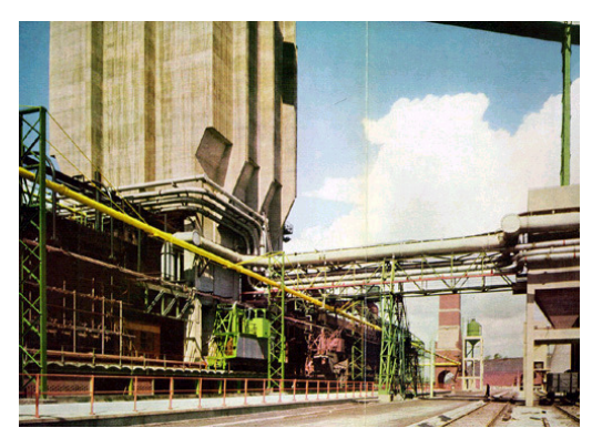
Fig.2 Top-charged coke ovens