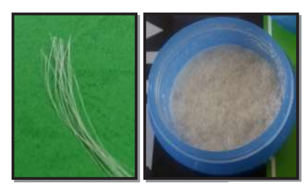
Figure 1. Bombyx mori silk fiber (left: strands, right: chopped fiber)

The metal mold sized 25 x 2 x 2 mm<sup>3</sup> was marked at a height of 0.5 mm for placing of resin and fiber, then the mold was placed on the glass plate. The flowable composite was injected into the mold until full for the sample group FRC fiber 0%, while the group with the addition of fiber (volume of 5%, 10%, and 15%) was injected to the marker limit (0.5 mm).<sup>28</sup> Fiber that had been mixed with flowable composite (ChamFill flow Denkist, Korea) by hand mixing with figure-eight motions was inserted into the mold, then the flowable composite was reinjected until the entire fiber surface was covered with resin and the mold was fully loaded. The FRC surface was covered with a celluloid strip followed by irradiation of the upper part of the sample using light curing unit perpendicular to the sample. Irradiation was continued at the bottom of the sample in the same way. After irradiation was completed the sample was removed from the mold and the excess was polished with 320 grit sandpaper (ISO 4049:2000).<sup>29</sup>