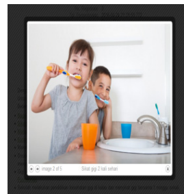
Figure 5. Suggestion for brushing teeth

for school children, namely: saliva pH, the amount of plaque, caries experience, utilization of dental health services, mother's behavior in selecting food for children, children's knowledge about dental health, children's behavior of dental health maintenance, children's behavior in selecting food; and the implementation of UKGS by teachers. 7 A'yun's Predictor Software has high sensitivity and specificity. This software is one of the new ways to describe the interaction of various factors that play a role in caries process APS was developed to create a better understanding of the multi-factorial aspects of dental caries for children and their parents, as well as to serve as a guideline in estimating the risk of new caries in school children. 8 This study aimed to determine the effect of APS on dental-oral health maintenance behavior, saliva pH, and PHPM index.