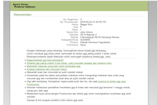
Figure 3. Suggestion and follow up of new caries prevention