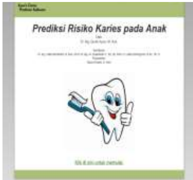
Figure 1. APS Program