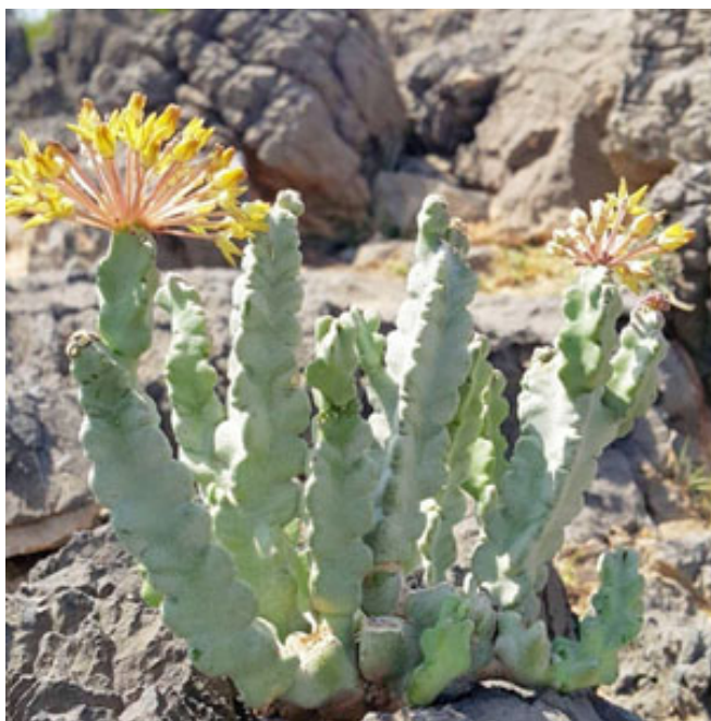
Figure 1 Caralluma flava N.E.Br. Meve & Liede (Snapshot was taken in the mountains of Jebel Akhdar in Sultanate of Oman; 11hr 45min/16 April 2016)