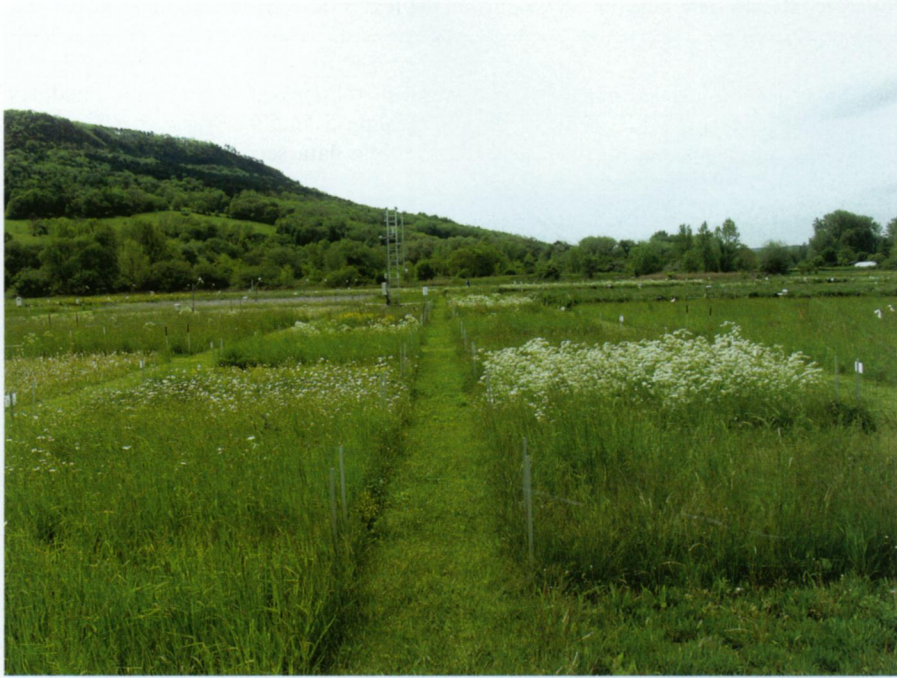
PLATE 1. Some dominance plots of the biodiversity experiment in Jena, Germany, in 2007. Here, nine dominant grassland species were established on 206 plots with a diversity gradient from 1 to 9 species.

of phylogenetic diversity in explaining the diversity effect (Hypothesis 2). Including terms for interactions between each pair of functional groups and for within each of the three functional groups (Kirwan et al. 2009) added to the explanatory power of the average interaction effect (model 5 vs. 2a, P < 0.001 and P = 0.011 ; Table 2). Jointly, average pairwise interaction and functional group effects explained most of the diversity effect, especially in Biodepth Ireland (model 2 vs. 5, P = 0.012 and P = 0.117 ; Table 2). Functional group effects were largely captured by community phylogenetic diversity in a single degree of freedom; including functional groups in addition to community phylogenetic diversity somewhat improved the fit only in Jena (model 5c vs. 4, P = 0.026 and P = 0.183 ; Table 2). The linear effect of community phylogenetic diversity did not add to the functional groups effect (model 5c vs. 5, P = 0.786 and P = 0.318 ; Table 2). These tests confirm the strong relationship between functional groups and community phylogenetic diversity (Hypothesis 3), with the latter capturing most of the functional group effect in a single degree of freedom. Results from the Jena data are explained and presented in further detail in the Supplement.