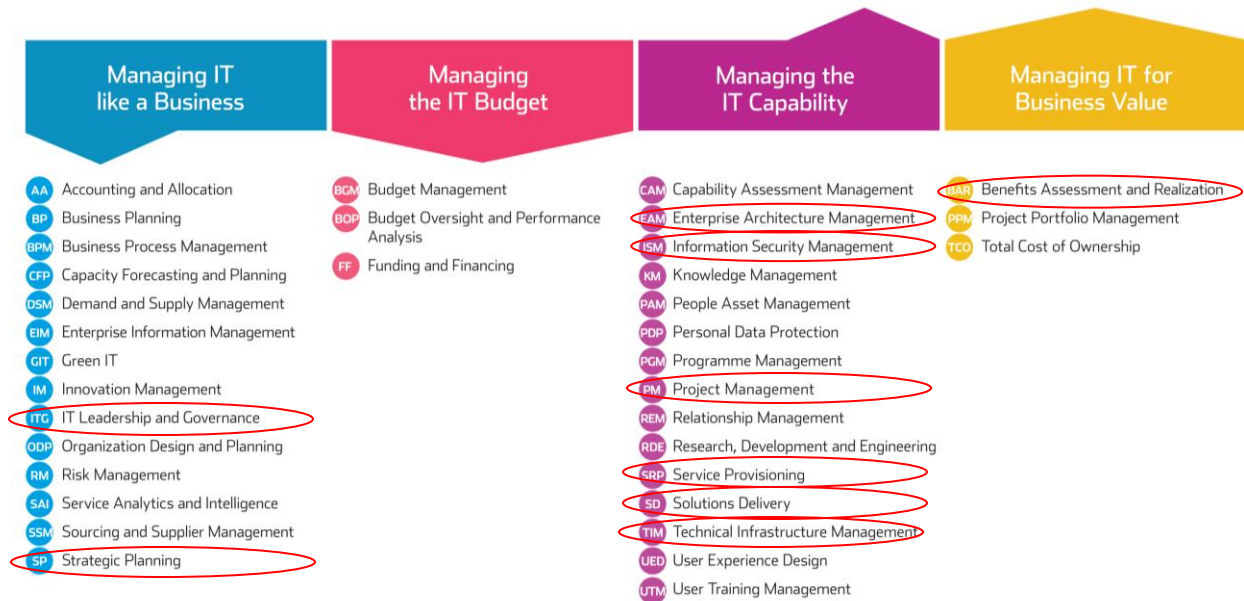
Figure 2 Nine Critical Capabilities of IT-CMF Support DevOps