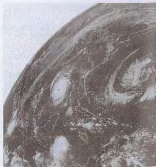
This weather image at http://rs560.cl.msu.edu:80/weather is just one example of images that can be downloaded to your own computer from World Wide Web sites

An Apple Macintosh LCIII with a 14" colour monitor. It has 4mb RAM (doubled to 8mb) and runs System 7.1. This is attached to a US Robotics Sportser Mac & Fax 14,400 baud modem. We have a Mac TCP stack and use Mac PPP (connection software) to connect to the Internet. For more details about GreenNet, call 0171 713 1941, fax 0171 833 1169 or e-mail: support@gn.apc.org .