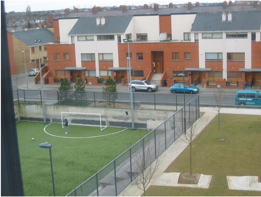
Figure 2. Fatima Mansions 2010