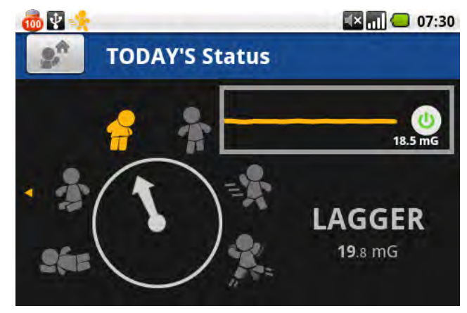
figure 1. Today's status screen of the user compared with the Mover community.

Copyright is held by the author/owner(s). MobileHCI 2011 , Aug 30–Sept 2, 2011, Stockholm, Sweden. ACM 978-1-4503-0541-9/11/08-09.