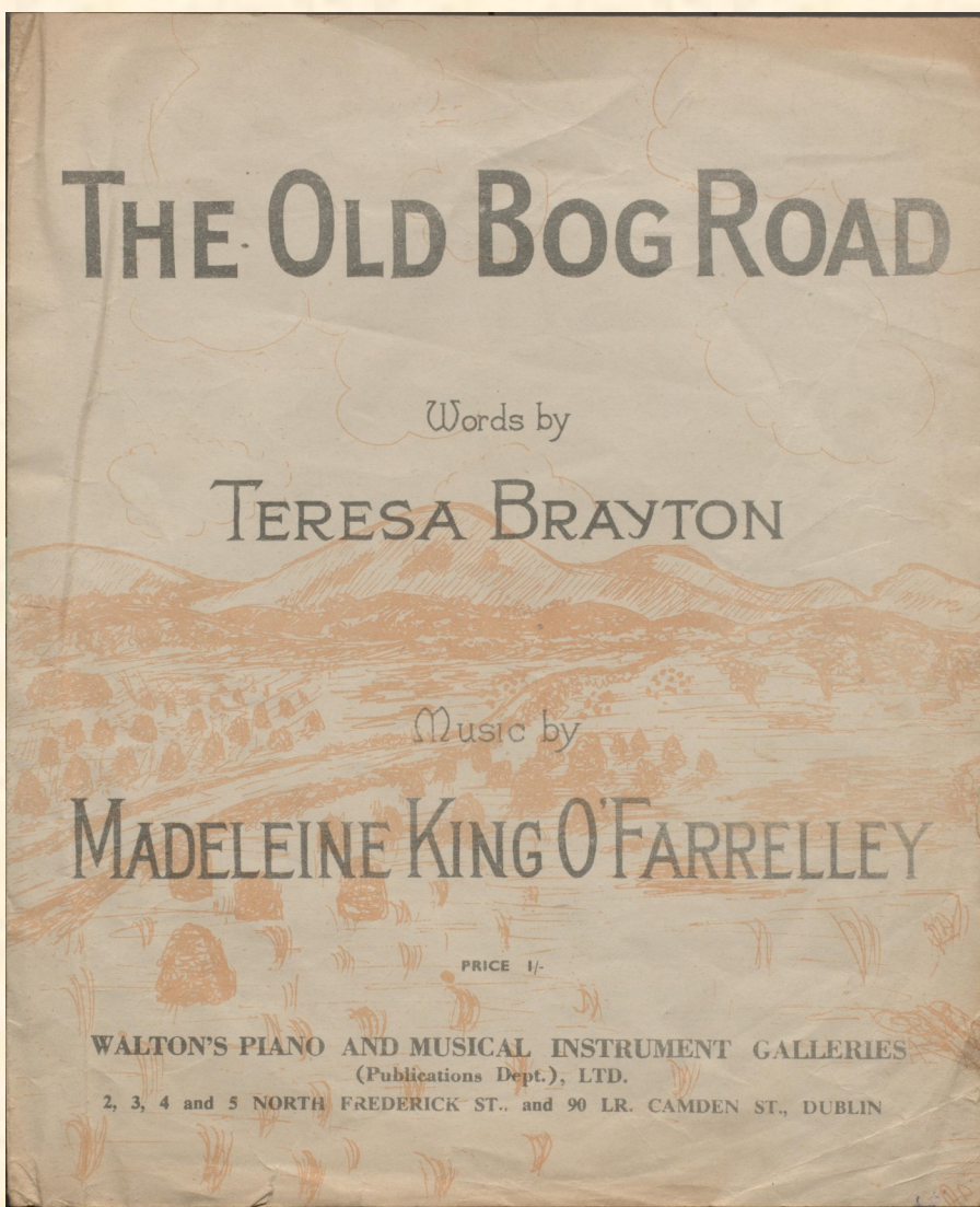
Sheet music for The Old Bog Road