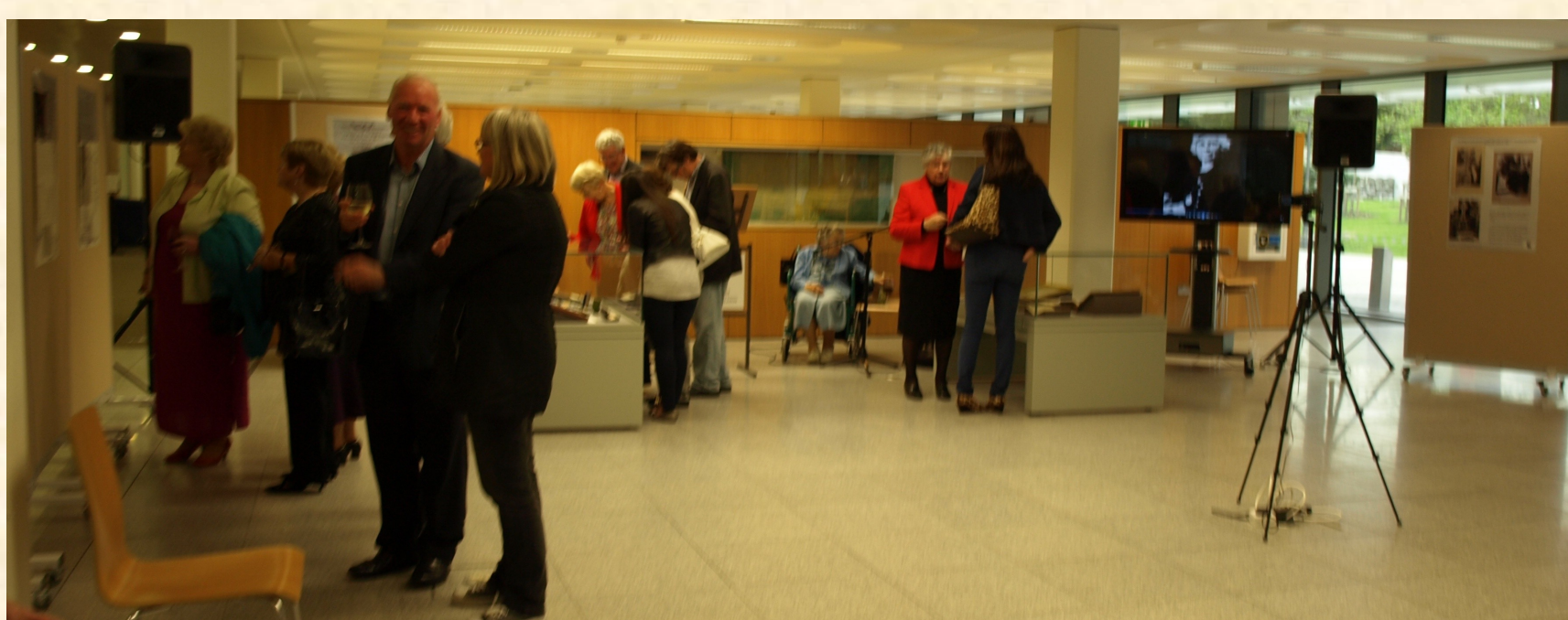
Launch of exhibition