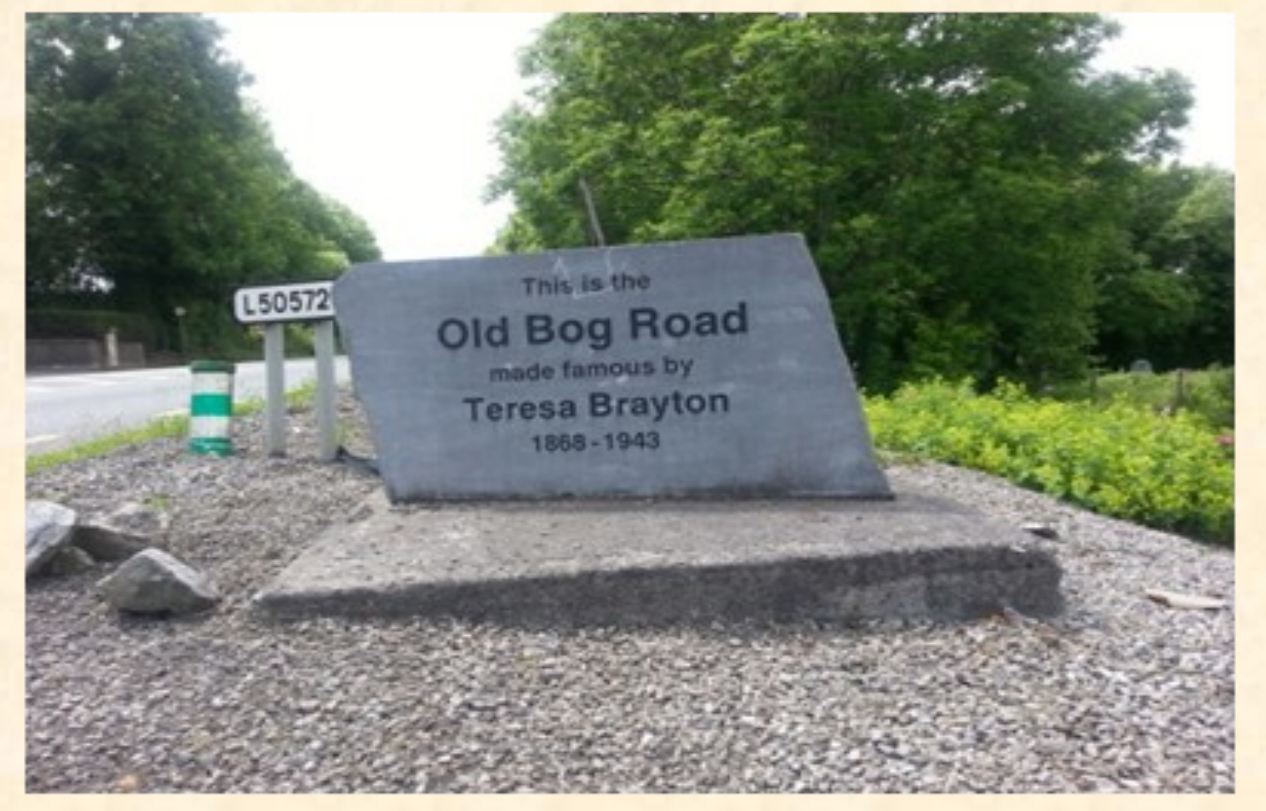
Entrance to Old Bog Road