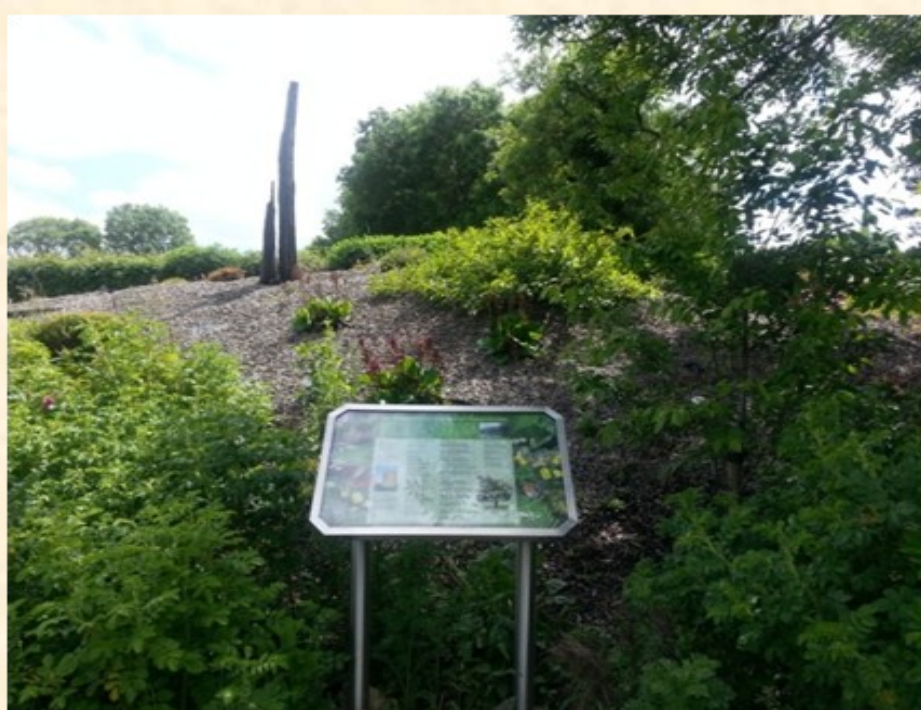
Information panel at The Old Bog Road