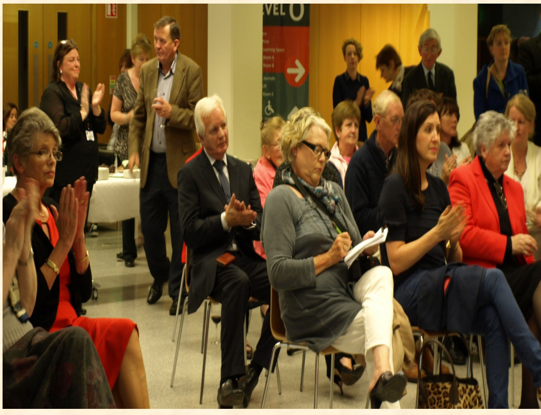
Launch of exhibition