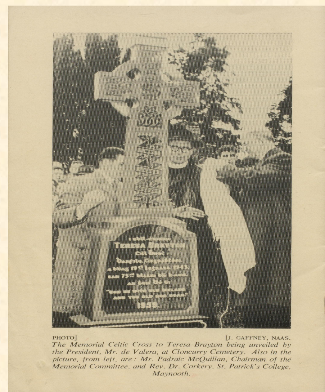
Unveiling of memorial cross by President de Valera in 1959