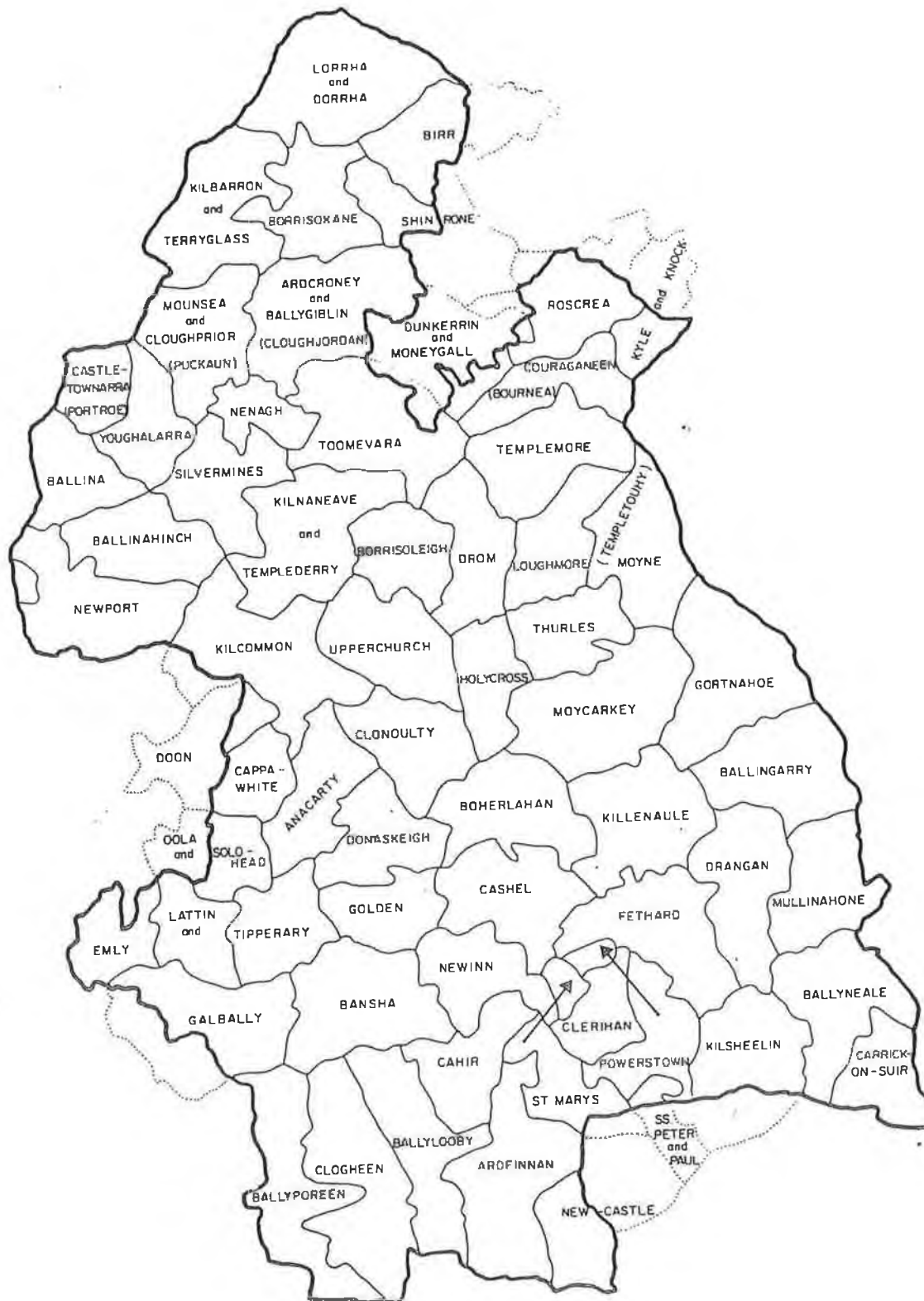
Fig. 1.1