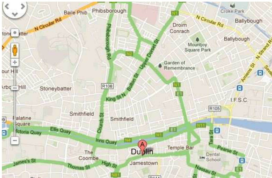
Map of Dublin North inner city (area between the Noth Circular Road and the river Liffey; Mountjoy Square is located in the upper right part of the map)

This is a place that hosts one of the poorest communities in Ireland and that local activists would describe as an area of “huge deprivation, accumulation of disadvantage, low income families, drug issues, and a lot of disaffected youths” (Seamus). So, the closure of that swimming pool would be a very cynical act by local authorities because with that “you are taking away a facility that actually provides an alternative to all this”; moreover “tens of thousands of children have learned to swim in this pool” (John). Not to mention the fact that that swimming pool was and to some extent still is a bathroom facility for many people in that constituency. “Because there were no such facilities in Saint Josef Mansions [a flat complex nearby] so every week the kids were brought there by their parents. And this was as a result of community activity that those pools were open” (John).