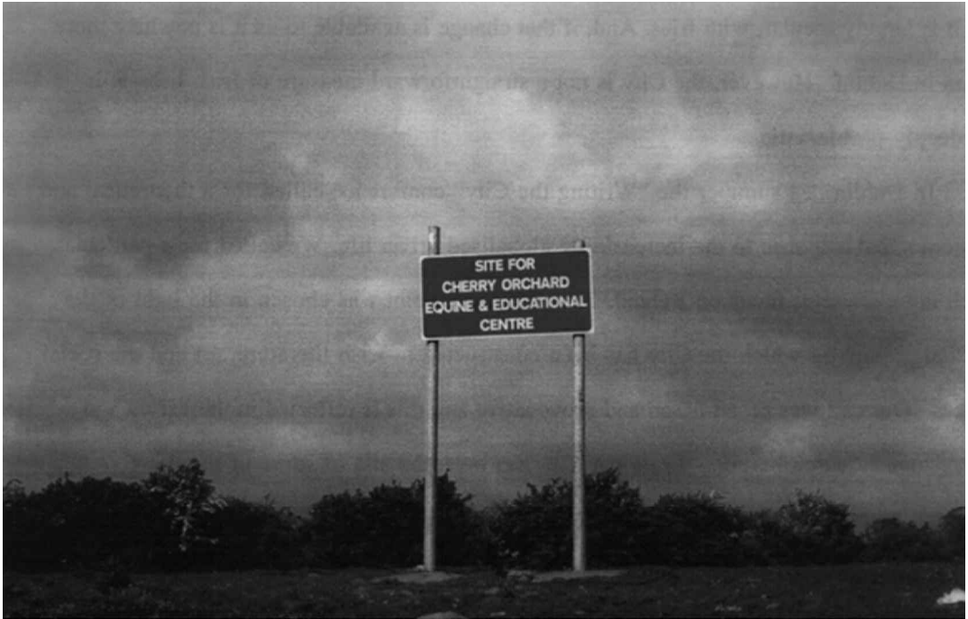
Figure 1 Site for the new Equestrian Centre in Cherry Orchard, Dublin.

The genuinely attractive idea is that there are strengths in any community and that these strengths can be built upon for socially desirable ends. Such language seems to promote an inclusive solution to problems by encouraging and (ideally empowering) various actors at the local level – business, residents, and representatives of statutory bodies and voluntary agencies (what in ‘Blairspeak’ in the UK are referred to as ‘stakeholders’) – to address issues as they arise. Finally, these policies seem to move away from top-down decision-making structures, associated with older understandings of governance and towards flatter ‘regulatory’ models of decision-making and action.