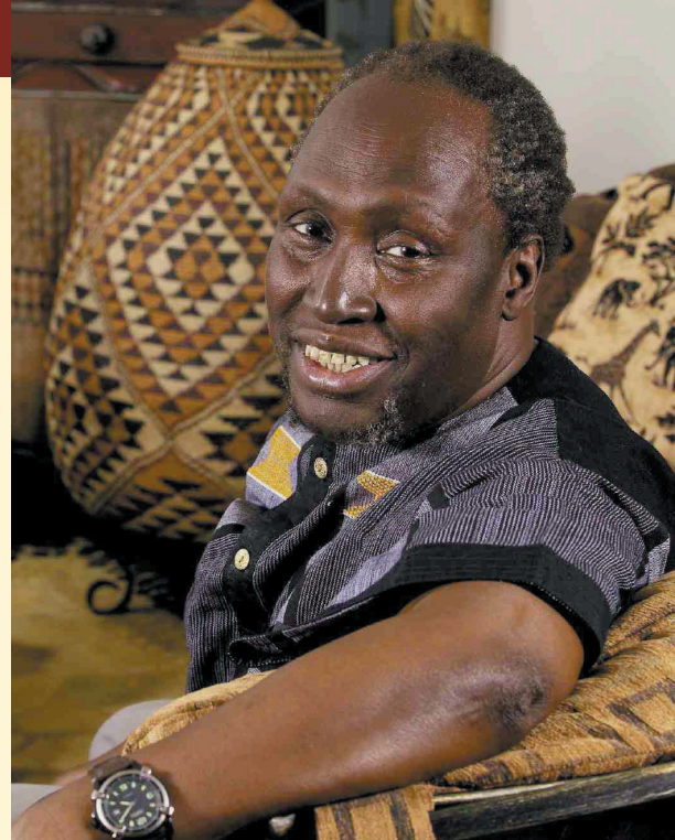
Kenyan teacher, novelist, essayist, and playwright, Ngugi wa Thiong'o is an important link between the pioneers of African writing and the younger generation of postcolonial writers. After imprisonment in 1978, Ngugi abandoned using English as the primary language of his work in favour of Gikuyu, his native tongue.

Released from prison in 1979, the year Daniel Arap Moi became President, Ngugi was barred from