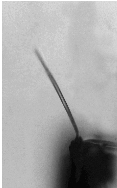
Fig. 2.2. Nictating infective juvenile (IJ) of Steinernema carpocapsae . The nematode stands on its tail and waves from side to side.

Dispersal and foraging strategy constrain the host range of EPN species indirectly. The IJs themselves discriminate directly among potential hosts. Knowledge of natural host ranges of EPNs could help predict which nematodes would be effective against a particular insect pest. When an EPN is isolated from soil, we are essentially ignorant of its natural host range because of the use of G. mellonella as a bait (Bedding and Akhurst, 1975). Current knowledge of natural EPN host ranges is limited to anec-