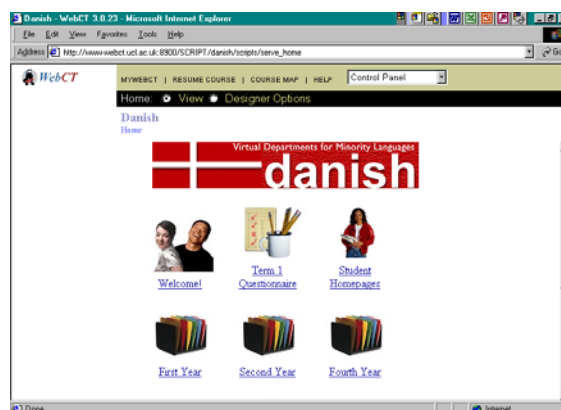
Figure 1: the Virtual Department (Students)

In early 2001, the virtual department was introduced to students. This, as stated, was a second WebCT 'course', functioning solely for the delivery of completed materials and tasks to the students. The homepage is shown at Figure 1. It was believed that online collaboration between learners would be more effective where they had met face-to-face in the first instance. This, coupled with the idea that the virtual department should encourage social interaction amongst teachers and students, led to an important decision. Students and tutors would be brought together in London for one day, in order to learn to use the virtual department and to meet each other and get to know the people to whom they would be talking online. After this 'Student Day' the regular use of the virtual department by students began.