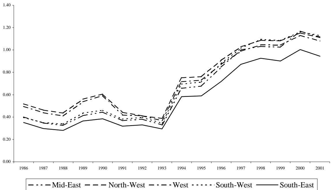
Figure 2. The ratio of profits from forestry to that of traditional farming