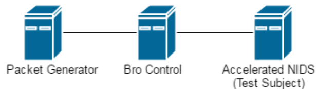
Figure 3: AMD Environment Testing Network Architecture

Figure 3 shows the testing network architecture using AMD GPU Environment for the test subject. The difference with NVIDIA environment is that in the NVIDIA environment, the packet capture and the service (packet scanning) is handled in the same computer, while in AMD environment the packet capture and service are handled in separate computer. Bro Control handles the packet capturing and send the packet to the test subject for packet scanning (Bro Control handles both packet capture and packet scanning in the first scenario). The criteria to check validity of the data is the same with NVIDIA environment, which the sent data and captured data are compared.