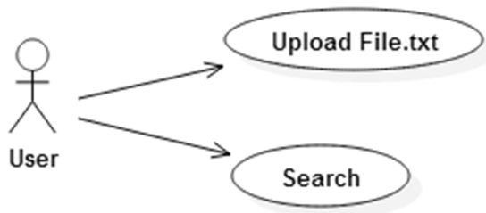
Fig. 2. Use Case Diagram

Figure 2 shows the use case diagram of a proposed work which has 2 cases namely Upload File Case and Search Case.