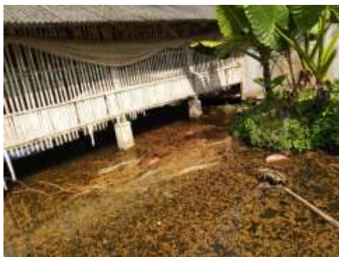
(a) Feed dirt animals chicken and Taro leaves

Here's the feed for the fish presented in Figure 3 as follows: