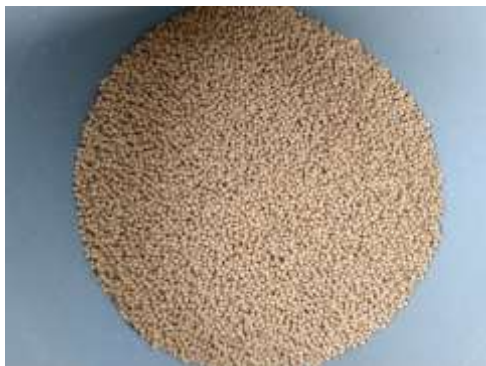
(b) Figure 3 Pellet Fish

Figure 3. Fish feed (a) feed dirt animals chickens and keladi leaves and (b) pellet fish