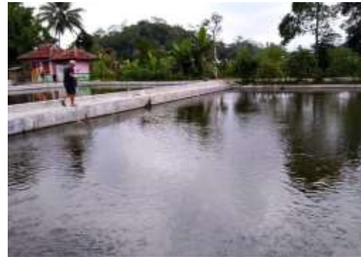
(a) Individual Pond Ownership

The following ponds used for freshwater aquaculture activities in Cibunigelis Village are presented in Figure 2 as follows: