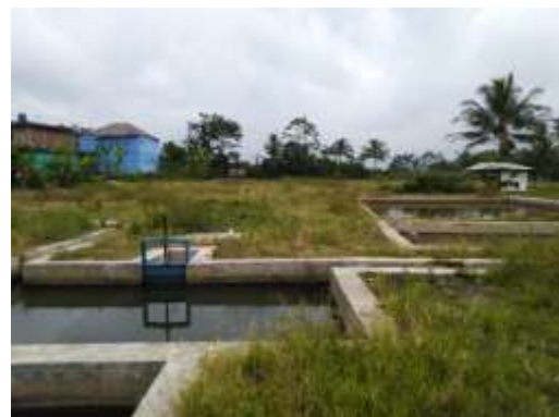
(b) Communal Pond Ownership

Types of fish are cultivated more on the type of consumption fish. Some of the cultivated fish are presented in table 4 as follows: