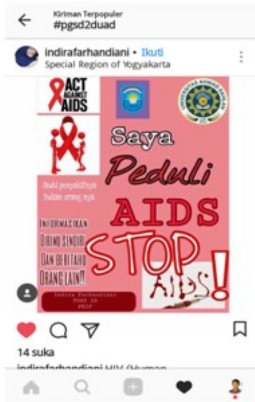
FIGURE 3 | One of Posters Result (The Task in 5E Larning Cycle)