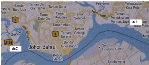
Fig. 1 Site of experimental