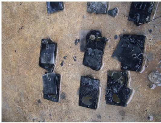
Fig. 3 Steel coupons taken at Danga Bay