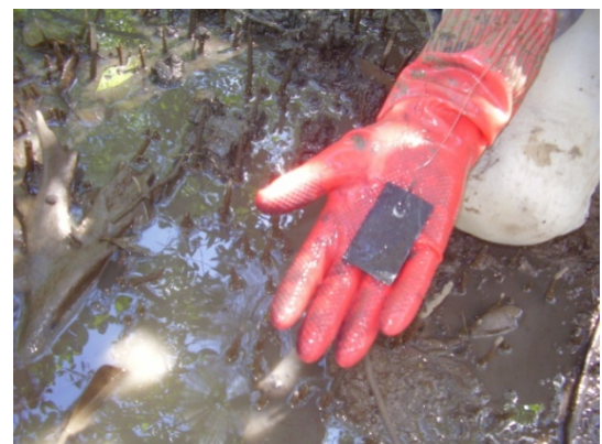
Fig. 2 Steel coupons taken at Permas Jaya

The steel corrosion which takes place in the marine environment consisting water and oxygen has lead to creation of black rust, which also known as Fe 3 O 4 giving blackish colour on the surface of both specimen. Identified as insoluble product, black rust or Fe 3 O 4 is a result of reaction between ferrous and hydroxide ion leading to creation of Ferrous Hydroxide (Fe(OH) 2 ) which then react further with additional hydroxide ion and sometimes also oxygen [7]. Other than that, it is also noticed that the coupons retrieved from near shore site has more uneven surface as compared to off shore site. The loss of smoothness on the coupon surface is an initial indication of more pitting corrosion points to appear on the surface if the exposure period becomes longer.