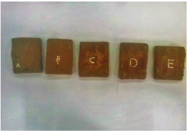
Fig. 2 Green state MOR test samples