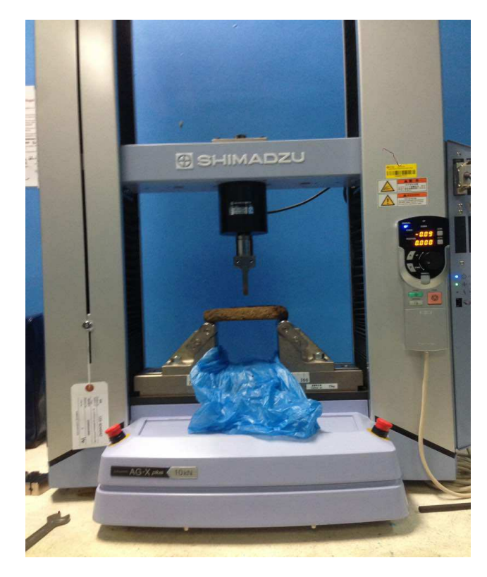
Fig. 5 Universal Testing Machine (Model: Shimadzu AGS-10kNXD) used to conduct 3 points flexural bending strength test in this research

where \sigma is the modulus of rupture (MPa), P is the maximum load applied until fracture occur (N), L is the length of span between two hold point (m), W is the width of the test samples (m), and H is the thickness of the test samples (m).