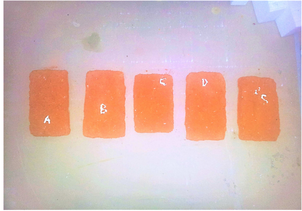
Fig. 3 Fired state MOR test samples