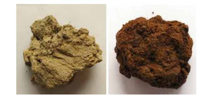
Fig. 4 Bentonite clays used as mould materials in this research, white bentonite (left) and red bentonite (right)