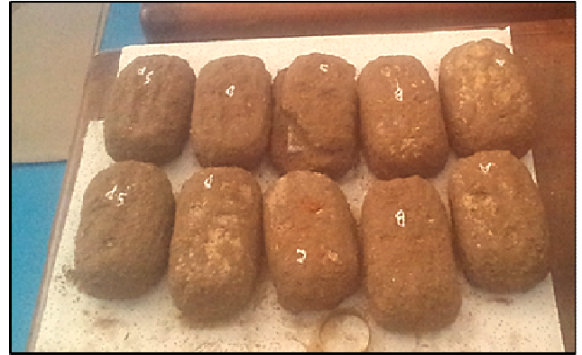
Fig. 1 Fabricated shell mould samples

(length x wide x thickness). The geometry of the pattern was intended to produce a plate shape mould as to perform 3 points flexural bending test to determine the samples strength. Total of 10 shell mould samples was fabricated whereas 5 of the samples required to determine the green strength, whilst the other 5 samples for fired strength. The fabricated samples are shown in Fig. 1. From these shell mould samples, MOR test samples were prepared by cutting the shell mould into a plate-shaped as Fig. 2 showing the green state of MOR test samples, and Fig. 3 showing fired state of MOR samples.