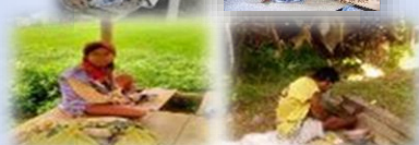
Table 2: Characteristic Client