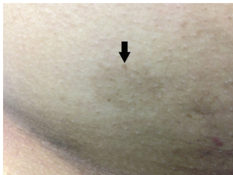
FIGURE 3: Café au lait macules in the anterior abdominal skin.