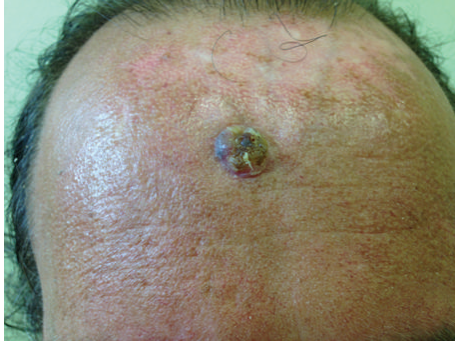
FIGURE 1: Basal cell carcinoma in forehead.

life expectancy and patients with BS rarely survived after their fifties [2]. Approximately 12% of BS patients can develop colon cancer, and the mean age at diagnosis is 35.4 years [2, 8]. The aim of this report is to present a patient with a BS who developed colon cancer at 40 years of age.