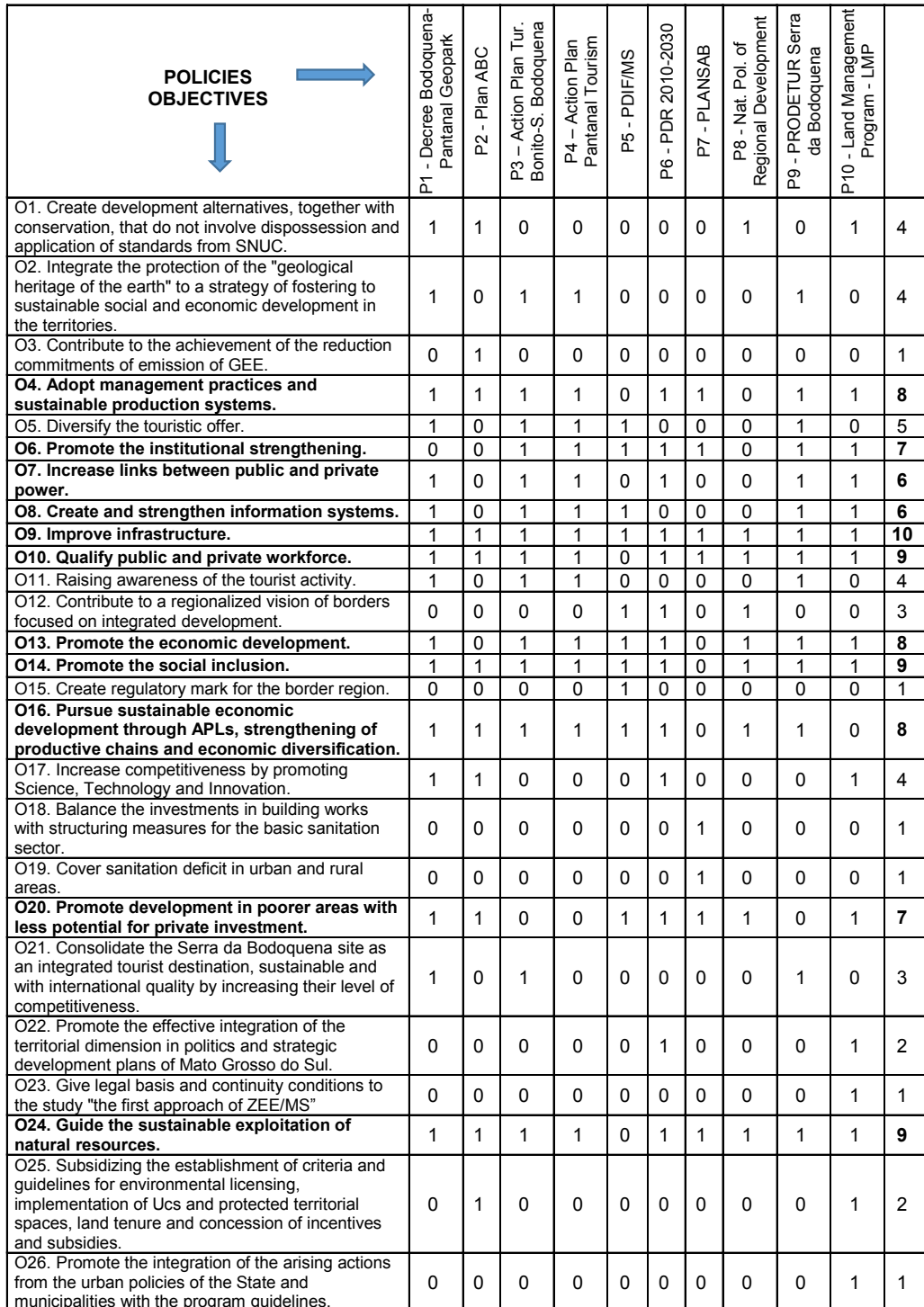
Table 1. Policies Matrix x Goals - MPO