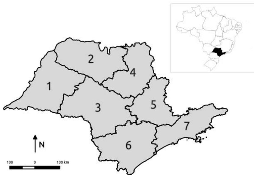
Figure 2. Map of the state of São Paulo showing the division of regions.

No significant difference in the prevalence of brucellosis infected herds for each region, or for the state, was observed between the 2001 (DIAS et al., 2009b) and 2011 serological surveys in the present study. As for the animal-level prevalence, no significant differences were observed as well. A comparison of brucellosis positive herds, and the positive animals between the 2001 (DIAS et al., 2009b) and the 2011 surveys is shown in Figure 3. The states of Espírito Santo (ANZAI et al., 2016) and Rio Grande do Sul (SILVA et al., 2016) also failed to lower the prevalence of brucellosis with their immunization programs.