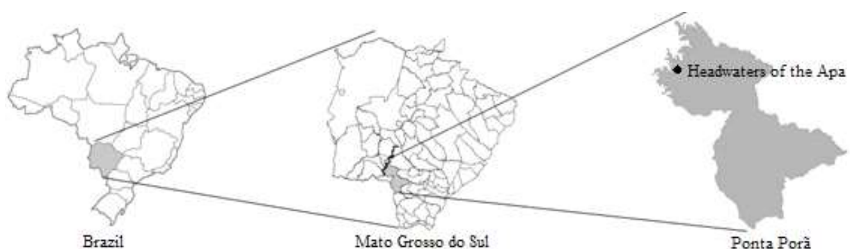
Figure 1 – The headwaters location of the Apa River in Ponta Porã, Mato Grosso do Sul, Brazil.

A total of 26,411 seedlings were collected, which were distributed in 50 species, 45 genera and 32 families, being three seedlings identified only by family.