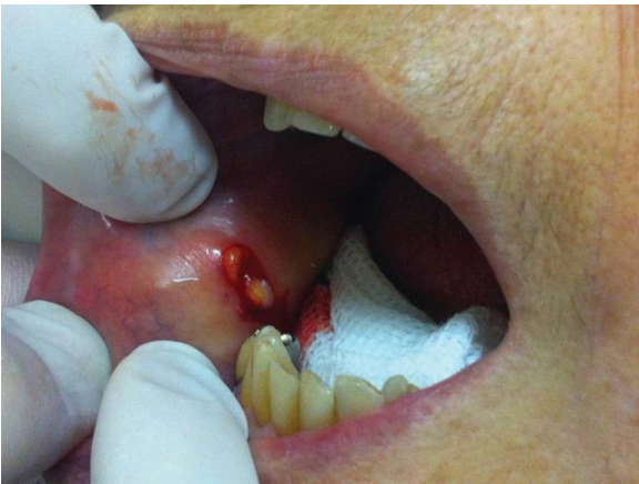
Fig. 1 Biopsy showing the yellowish coloration and hard consistency from right buccal mucosa.

To determine the patient's past medical history, a slide review was requested, which confirmed the previous histopathologic results. The confirmation of the previous facial filling was stated by the patient's caregiver, who said that the patient had facial plastic surgery 20 years before in a private clinic, which explained the lack of this information on the patient's medical records in our hospital.