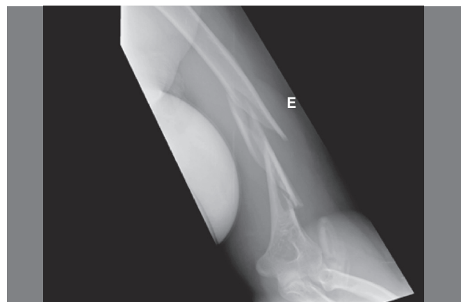
Figure 2. Preoperative X-Ray (AP) of patient with fracture of the distal third of the humeral shaft.