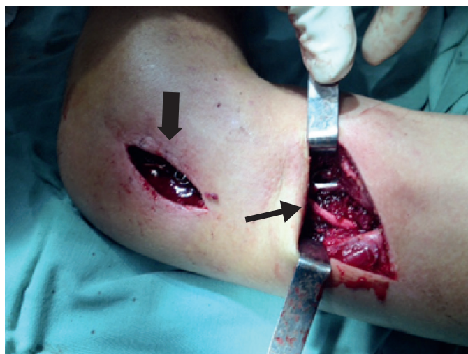
Figure 1. Kocher distal access way (thick arrow) and accessory access way with radial nerve isolated (thin arrow). Note plate below nerve.

The range of motion of the elbow was evaluated by values in degrees recorded in medical records, previously measured with a simple goniometer. For the functional evaluation of the elbow, we used the Mayo Elbow Performance Score (MEPS). 15 Neuropraxia of the radial nerve was assessed by levels of paresthesia and degree of strength (0-5) according to the scale of the British Medical Research Council. We also evaluate the recovery time of the neurological injury. The study was approved by the local Ethics Committee.