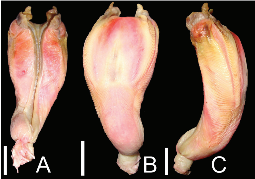
Figure 1. Right hemipenis of Tupinambis quadrilineatus (CHNUFPI 0036). A sulcate surface B asulcate surface C lateral region. Scale bar = 1 cm.

hemipenis, which lacks the lateral and medial expansion pleats and has more laminae (distal laminae: 56–71 and proximal laminae: 33–40) than other teiids (Harvey et al. 2012). See Table 1 for the differences in the hemipenial morphology of three subfamilies of Teiidae (Harvey et al. 2012). The morphology and ornamentation of the hemipenis play an important role in the diagnosis of species, and have proven to be an excellent indicator of the phylogenetic relationships among taxa (Cope 1896, Böhme 1988, Harvey et al. 2012). Harvey et al. (2012) concluded that the relationships among the genera of Tupinambinae, especially Tupinambis and Salvator , require further study, and that a more detailed analysis of hemipenial morphology, as well as muscles and osteology, may contribute to a more definitive understanding of the systematics of the group.