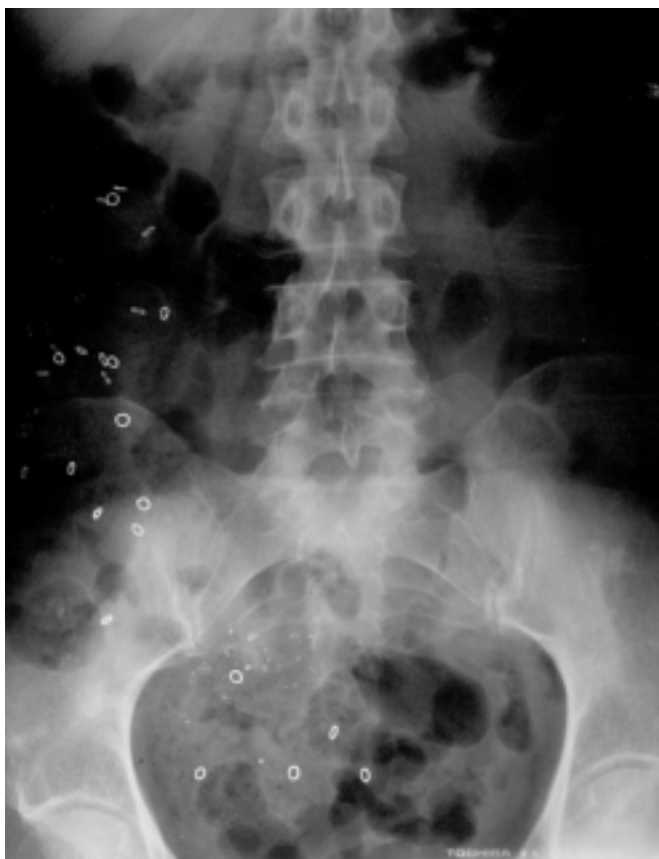
Figure 2 - Colonic inertia in a constipated patient with Chagas' disease (ChC). An X-ray obtained on day 7 shows stasis of the radiopaque markers in the ascending colon.

when a decrease of markers was observed on the X-ray. IC and ChC patients were divided according to total CTT into those with “normal transit” and those with “slow transit”, the latter when total CTT was longer than 65 h (Figure 1). Slow colonic transit was shown in 65% of IC (11 out of 17, 10 females) and 27% of ChC (4 out of 15, 3 females; P = 0.03 ). There was no difference between slow transit IC and slow transit ChC patients in total CTT (Table 2). In addition, all patients with prolonged transit reported the chronic use of laxatives.