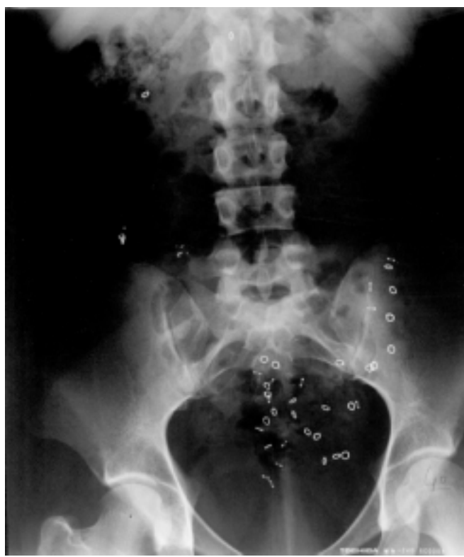
Figure 4 - Outlet obstruction in a patient with idiopathic constipation (IC). An X-ray taken on day 4 shows aggregation of markers in the rectosigmoid. The same pattern was observed on day 7.