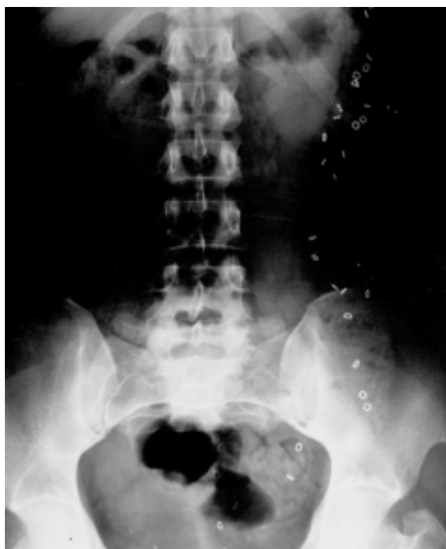
Figure 3 - Hindgut dysfunction in a patient with idiopathic constipation (IC). An abdominal X-ray taken on day 7 shows stasis of radiopaque markers in the left colon.

The proportion of slow colonic transit observed among our ChC patients was similar to that reported by Pemberton et al. (16) who found a demonstrable abnormality in