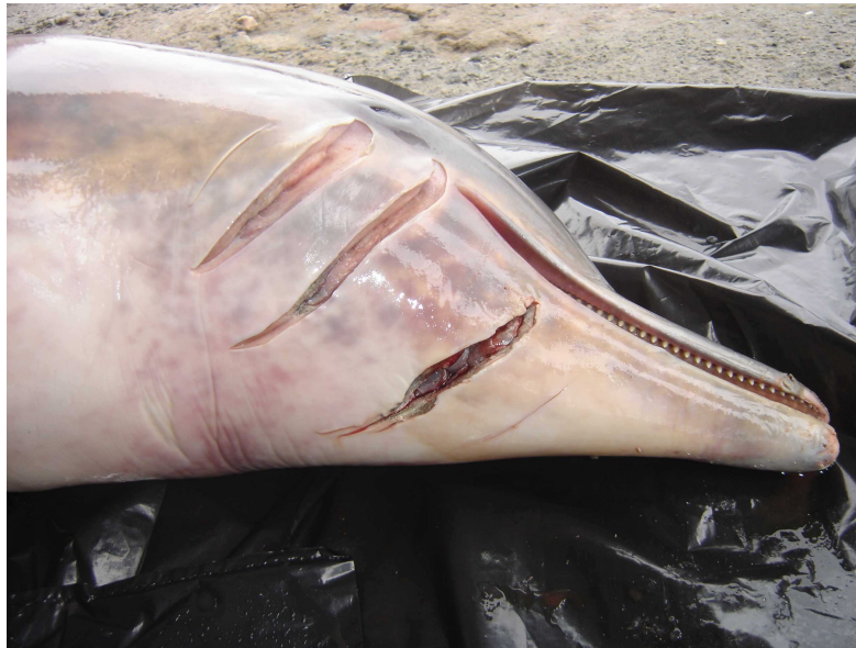
Fig. 11. Guiana dolphin ( Sotalia guianensis) found dead in Santos with fresh propeller marks which represented the main cause of its death.