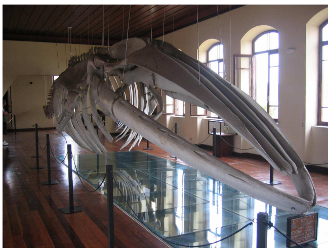
Fig. 2. An 18-m long skeleton of a fin whale ( Balaenoptera physalus ) found washed ashore at Peruíbe in 1941. It is on exhibition at Museu do Instituto de Pesca, Santos.

• Eubalaena australis Desmoulins, 1822: Two right whale tympanic bullae (MZUSP-2758 and 19837), collected in Iguape in 1902, were reported by Castello and Pinedo (1979). Sightings and strandings were recently updated by Lodi et al. (1996) and Santos et al. (2001a). A total of eight strandings were reported between 1936 and 2000 (see updated list in Santos et al., 2001a). Another stranding occurred on 15 August 2007, of a 4.5 m long male found at Itanhaém (CEEMAM-319). Most stranding records (67%) related to calves, three occurrences of which were related to individuals presenting vestiges of the umbilical cord.