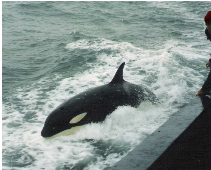
Fig. 6. A juvenile killer whale ( Orcinus orca ) riding close to a research vessel from CETESB in shallow waters of São Sebastião in September 1988.