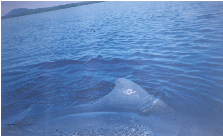
Fig. 9. Male bottlenose dolphin ( Tursiops truncatus ) named “Flipper” released from captivity in southern Brazil (27°S) in 1993 and found in April 1994 in the estuary of Cananéia (25°S). The Brazilian flag had been freeze-branded on its dorsal fin.