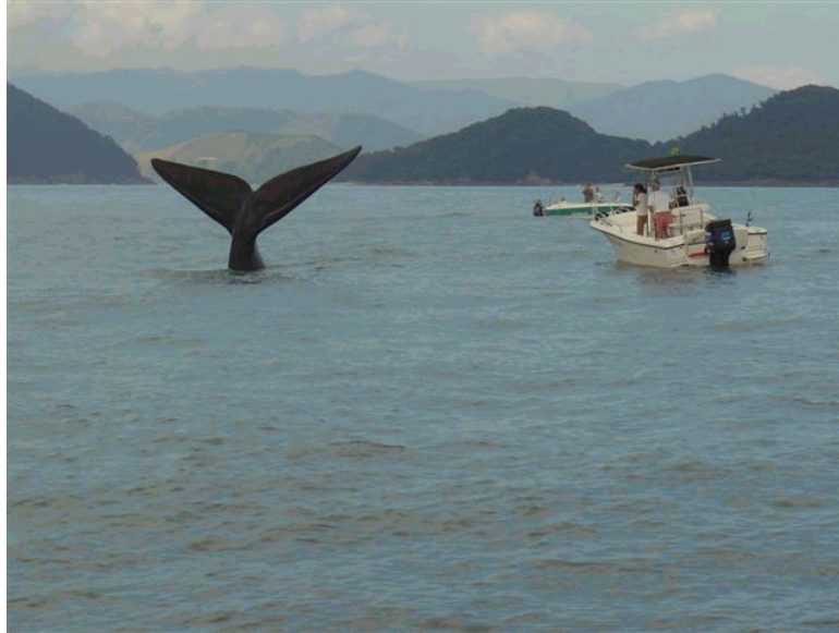
Fig. 12. Unsupervised approach to a female right whale ( Eubalaena australis) in São Sebastião and which could lead to collision and trauma for both observers and whale.