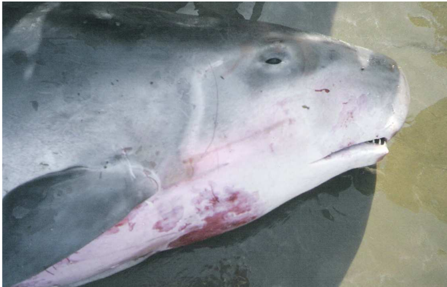
Fig. 5. Pregnant pygmy sperm whale ( Kogia breviceps ) of 288cm washed ashore at Santos on 11 July 2000 (CEEMAM-090).

• Berardius arnuxii Duvernoy, 1851: The only known occurrence of this species on the SP coast was reported by Siciliano; Santos (2003). On 04 August 1993, a 7 m long Arnoux beaked whale in an advanced state of decomposition was observed floating in São Sebastião coastal waters. It was buried and recovered six months later when the correct identification based on cranial features was made. The whale's nearly complete skeleton, without a collection number, is on exhibition at the Balneário dos Trabalhadores, São Sebastião.