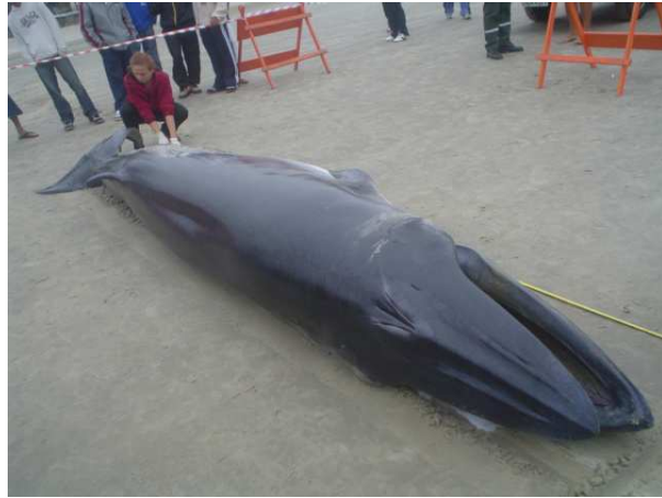
Table 2. Minke whale strandings on SP state coast. Antarctic ( B. bonaerensis ) and common ( B. acutorostrata ) minke whales are represented by "A" and "C", respectively. TL means "Total Length" given in metres (m), "U" unknown and "Sp." species.