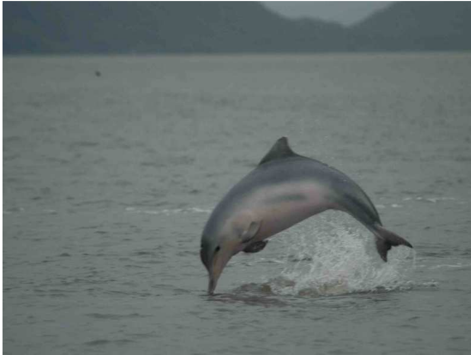
Fig. 10. Guiana dolphin ( Sotalia guianensis ) in the Cananéia estuary: the most commonly seen cetacean species throughout the SP coast.