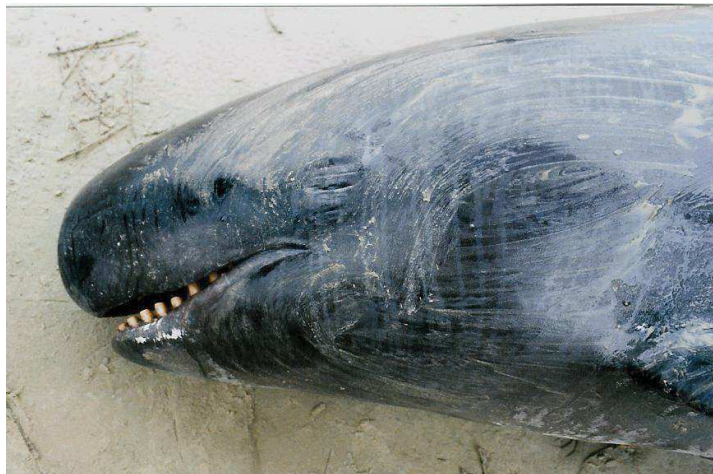
Fig. 7. A 4.3 m long male false killer ( Pseudorca crassidens ) found dead at Bertioga on 31 May 2005 (CEEMAM-219).