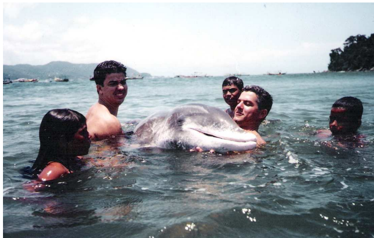
Fig. 8. A 250 cm long male rough-toothed dolphin ( Steno bredanensis ) with volunteers after its stranding on 28 December 1998 (CEEMAM-055), before it left the area.

• Tursiops truncatus (Montagu, 1821): Forty unpublished stranding records of bottlenose dolphins are listed in Table 6. A nearly complete T. truncatus skeleton was collected on the Praia da Juréia on 12 July 1986 (MZUSP-20382), but no further information was available. A male bottlenose dolphin, captured in Santa Catarina state (27°S) in 1983 for display at a small facility in São Vicente, was sighted in May 1994 in the southern waters of the SP coast after its release at the selfsame spot at which it was captured in April 1993. It was freeze-branded on both sides of its dorsal fin for tracking purposes. Subsequently it was observed in Cananéia estuarine waters (25°S) for at least two days (Fig. 9) and then it moved northwards to Santos (24°S), where it was frequently seen interacting with swimmers for three