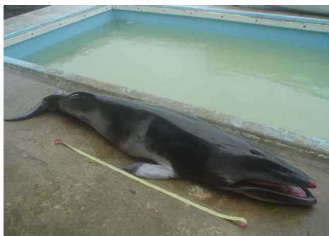
Fig. 4. A 2.2 m long female common minke whale ( Balaenoptera acutorostrata ) washed ashore at Guarujá on 07 August 2007 (CEEMAM-316). Photo: Andréa Maranhão.