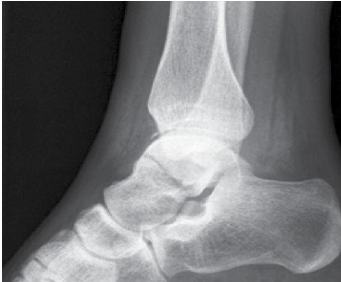
Figure 1. Lateral radiograph of ankle, exemplifying the images used during the evaluation (DOT-HC/Unicamp). Image contributed by the Department of Orthopedics and Traumatology - HC/Unicamp.

The cases were collected retrospectively, excluding pathological fractures, associated malleolus fractures or patients with deformities in the ankle secondary to other pathological processes. The evaluations were carried out in an auditorium, with the classification presented to the survey participants by an orthopedic surgeon. Afterwards, a copy of Hawkins' original article was distributed for reading and reference during the evaluation. During the evaluation process, all the participants also received a schematic drawing of the classification. (Figure 2)