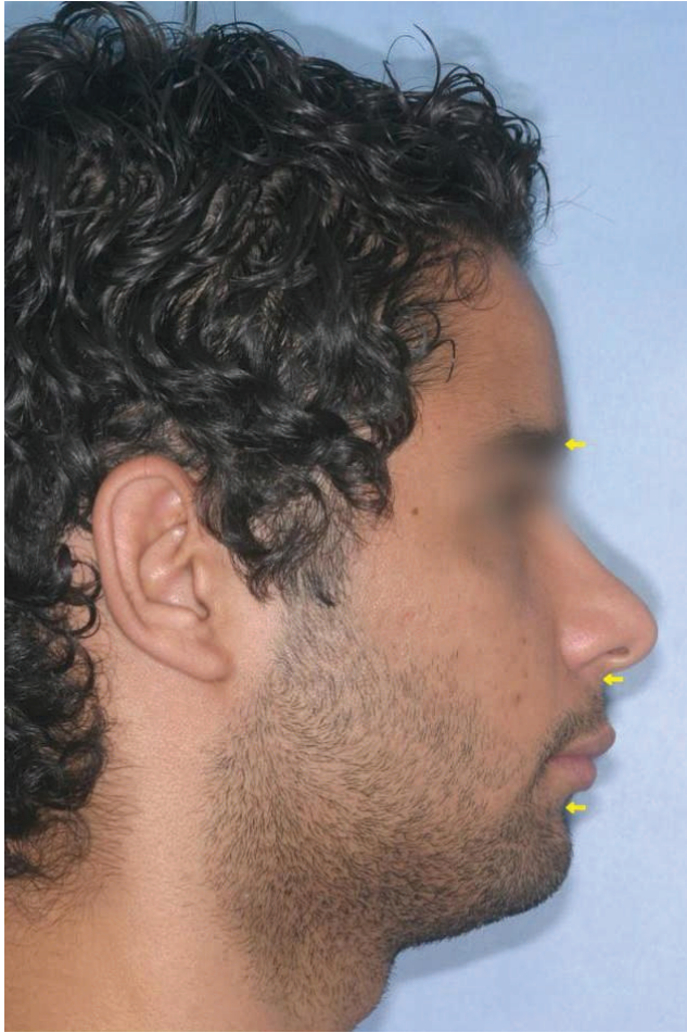
Figure 3. Photographs of a patient classified as pattern II. The arrows show the positions of the craniometric points of the glabella, subnasale, and menton. The convex profile is evident from the anterior position of the subnasale for the other two points.

takes into consideration the skeletal facial growth of patients, other than the Angle classification, which is based on the dental relationship. 19