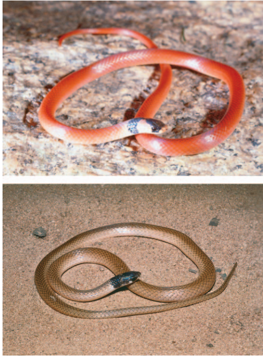
FIG. 1.— Tantilla boipiranga female (paratype, IB 64088), 313 mm total length in life (upper); T. melanocephala female (ZUEC 2491), 331 mm total length in life, from the Estação Ecológica de Itirapina, Brotas, São Paulo, southeastern Brazil (lower).

Tantilla boipiranga is readily distinguished from the other species of the T. melanocephala group by its uniform reddish orange dorsal color with no middorsal or lateral stripes. Additionally, the new species is distinguished from T. melanocephala by the broad medially divided pale nuchal band, absence of a lateral extension