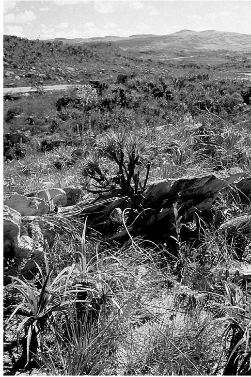
FIG. 4.—Type locality of Tantilla boipiranga in the Serra do Cipó, Minas Gerais, southeastern Brazil, showing the hilly terrain, rocky outcrops, and characteristic vegetation with a Vellozia treelet in center foreground.

tantan, and we found no specimens of T. boipiranga .