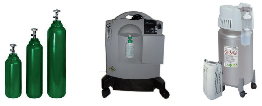
Figure 1 Sources of oxygen (gas cylinder, oxygen concentrator, and liquid oxygen).

There are now electronic devices that release the gas only during inspiration, substantially reducing the losses that occur with continuous flow, decreasing the need for refills. However, they are not recommended for small children due to lack of system activation by the child's spontaneous breathing.<sup>17</sup> The main disadvantage of liquid oxygen is its high cost.