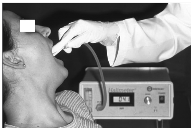
Figure 2. Halitometry Technique - Illustration of the procedure to measure VSC with the Halimeter device.

gy development represented a considerable advance concerning to halitosis diagnosis and assessment of the treatment used.