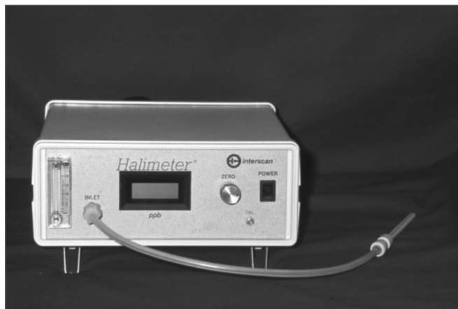
Figure 1. Halimeter: an objective measurement of Volatile Sulphur Compounds (VSC)

The organoleptic assessment is a subjective measurement. It is a very good qualitative method, however not very precise concerning to quantity. It depends on the examiner's olfaction accuracy what may change in case of influenza, environment humidity, etc 10 . The patient is asked to come to the office during the period he/she feels the halitus is at its worst. He is also asked not to use mouth rinses and the toothbrush at least two hours before the test. The test consists on asking the patient to breathe deeply inspiring the air by nostrils and expiring by mouth, while the examiner sniffs the odor at a distance of 20 cm, considering it unpleasant or not in a scale of 0 to 510. Self-examination can be relevant as it involves the patient in the process. Licking his/her own wrist, smelling it after a while, reflects the saliva contribution to oral malodor. Because organoleptic assessment is a subjective measurement, examiners must use an objective test such as Halimeter® (Figure 1) or BANA® test to confirm results 10 . The technolo-