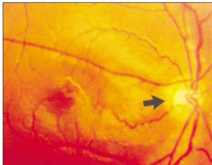
Figure 1 - Photograph of the retina demonstrating the double ring appearance of a hypoplastic optic disc

In some cases, intellectual and neurological development as well as language and behavior of SOD patients have been described as normal. Williams et al. (7) studied a group of chil-