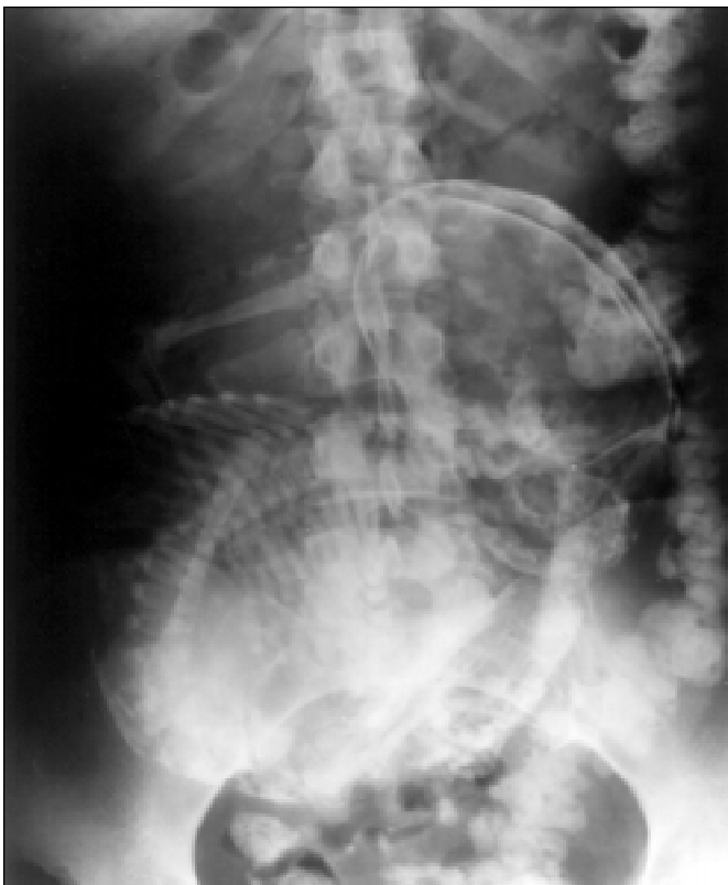
Figure 1. Calcified Abdominal Pregnancy - Abdominal X-ray.

The diagnosis is revealed by a suggestive clinical history, a pelvic mass found during the physical