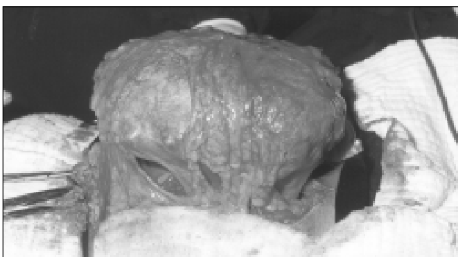
Figure 2. Calcified Abdominal Pregnancy - Epiploon adherence.