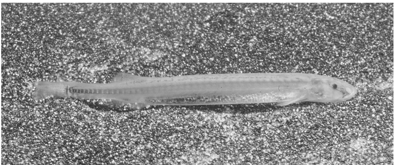
Fig. 4. Lateral view of the candiru Paracanthopoma sp. in field aquarium. Note the long and sloping snout, stout body, partly digested blood in the distal part of the gut, and fat globules along the abdominal wall.