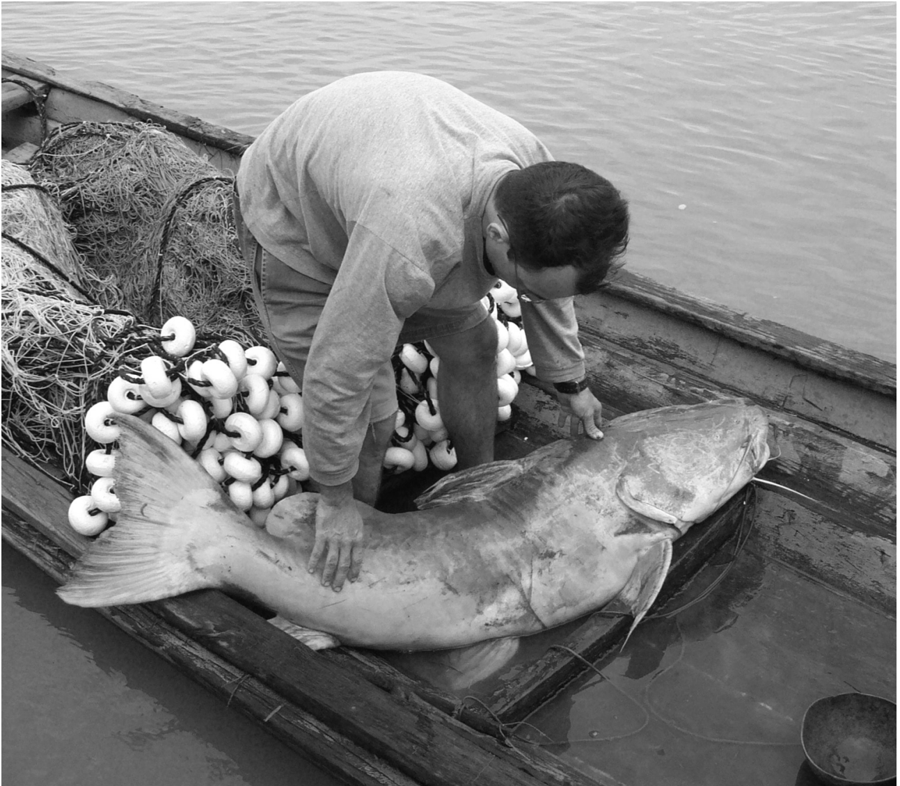
Fig. 1. A giant jau catfish ( Zungaro zungaro ) still on the canoe, being examined for candirus. Note a candiru attached on the middle of the caudal fin.