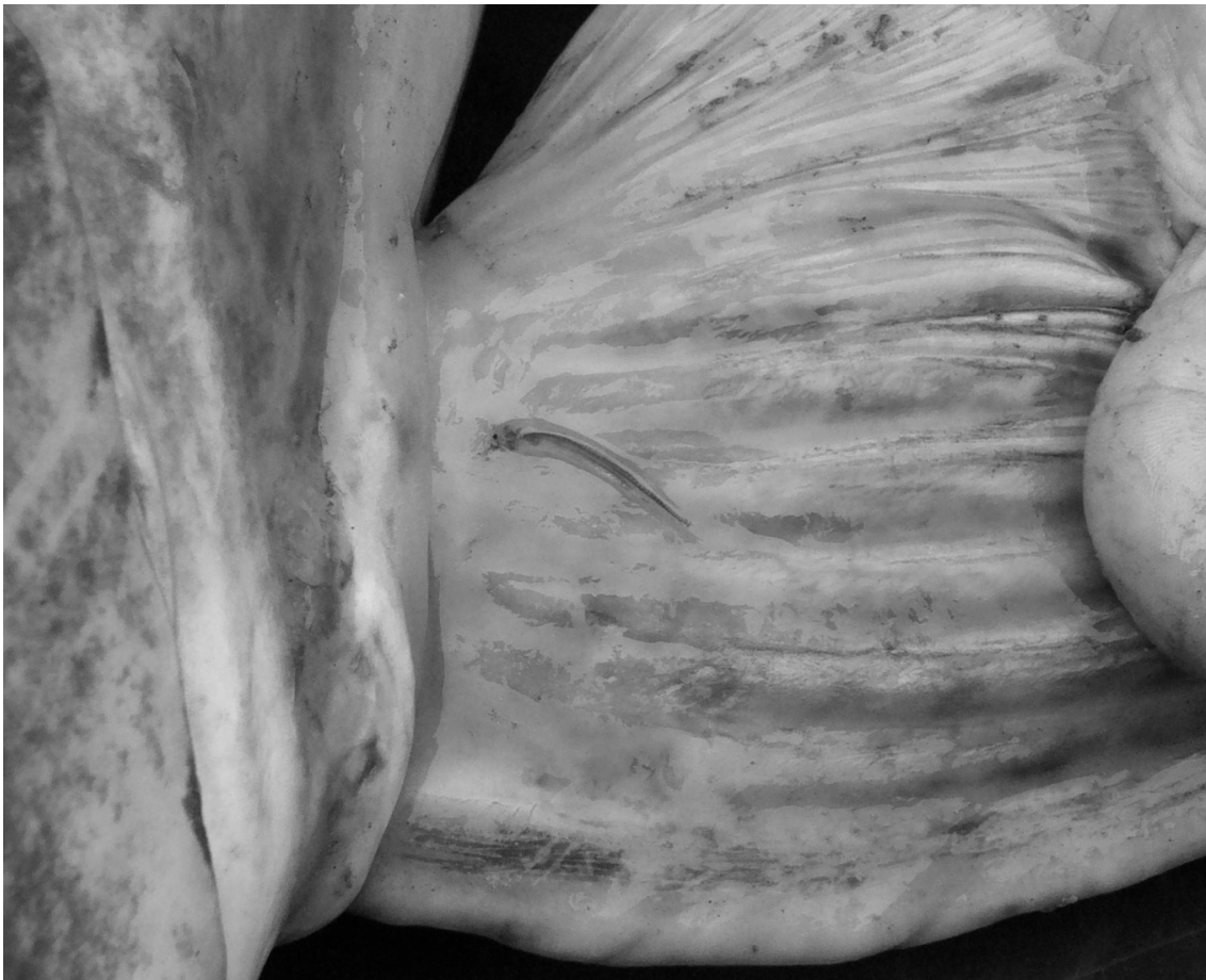
Fig. 2. A candiru ( Paracanthopoma sp.) with its snout buried into the pectoral fin of the giant catfish Zungaro zungaro . Note that the candiru 's eyes are exposed.